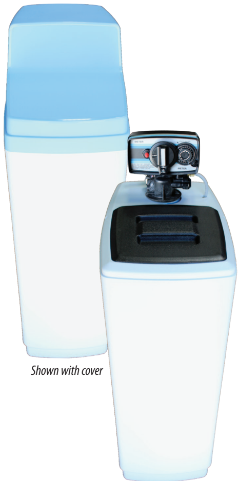
Shown with cover