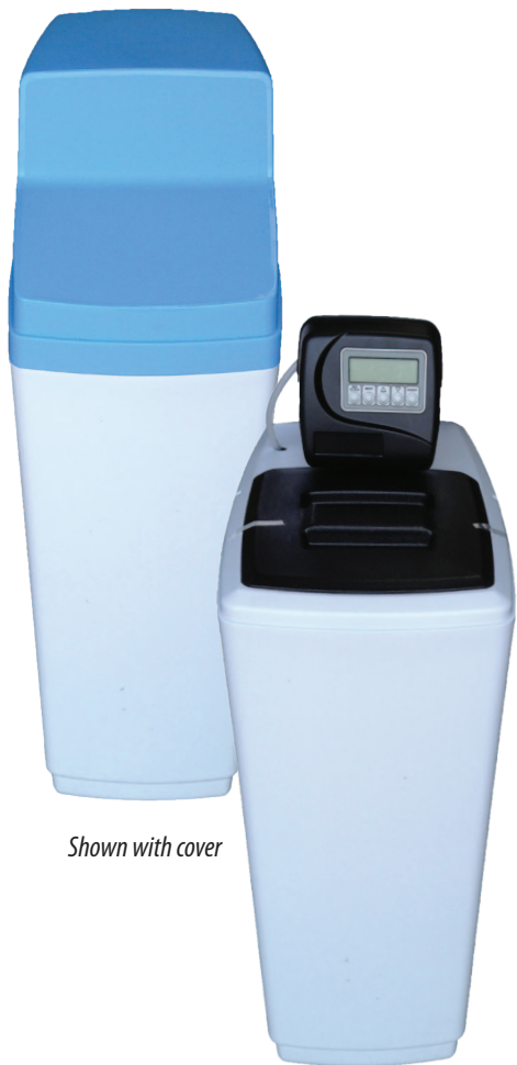
Shown with cover