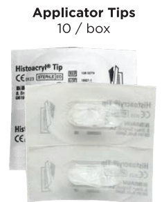
Applicator Tips 10 / box

Medical Director Authorization is required to purchase this product. Please consult your Medical Director to establish guidelines for use and protocol.