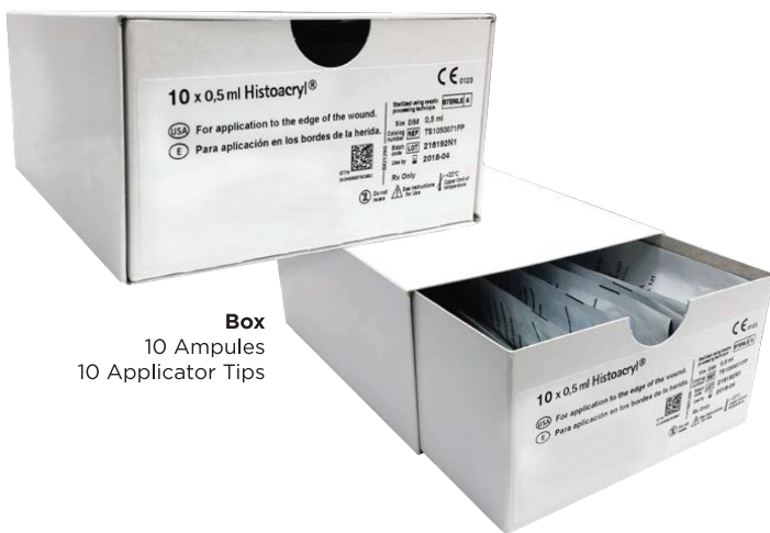
Box 10 Ampules 10 Applicator Tips