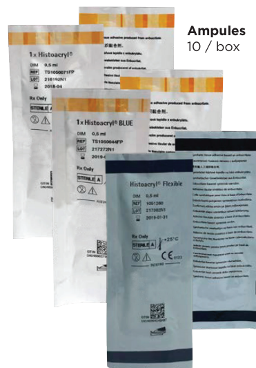
Ampules 10 / box