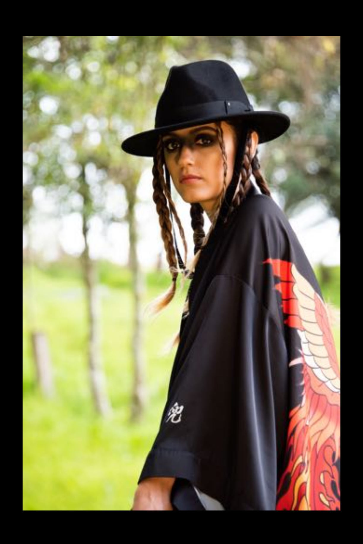
Katniss Unisex Kimono in Black