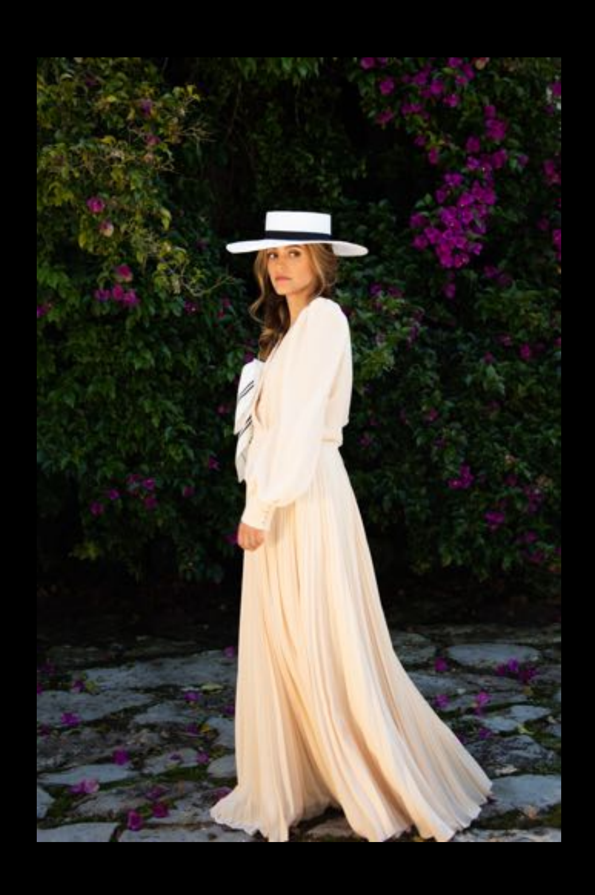
Madison Skirt in Soft Peach