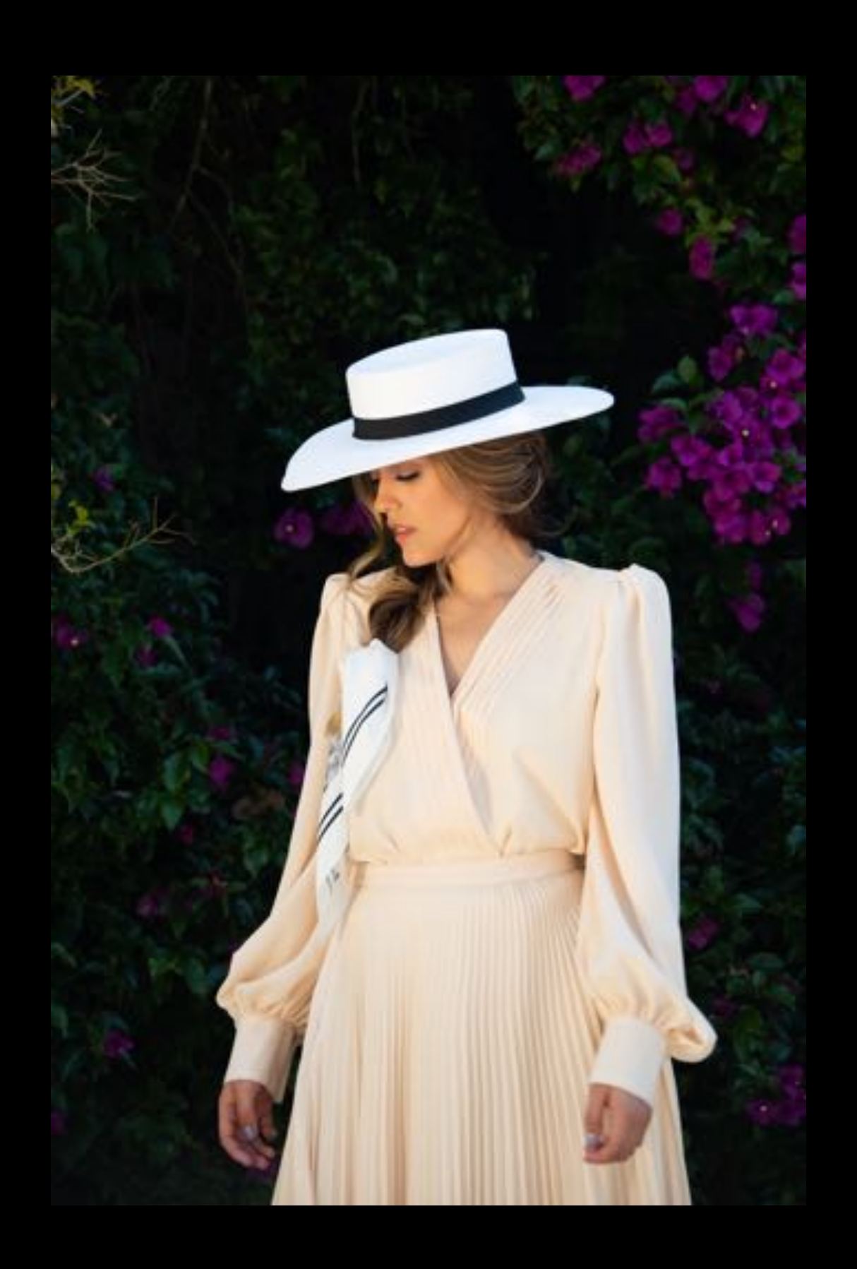
Denise Body Blouse in Soft Peach