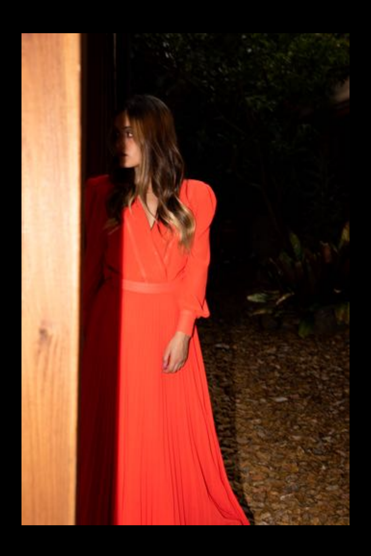
Madison Skirt in Orange