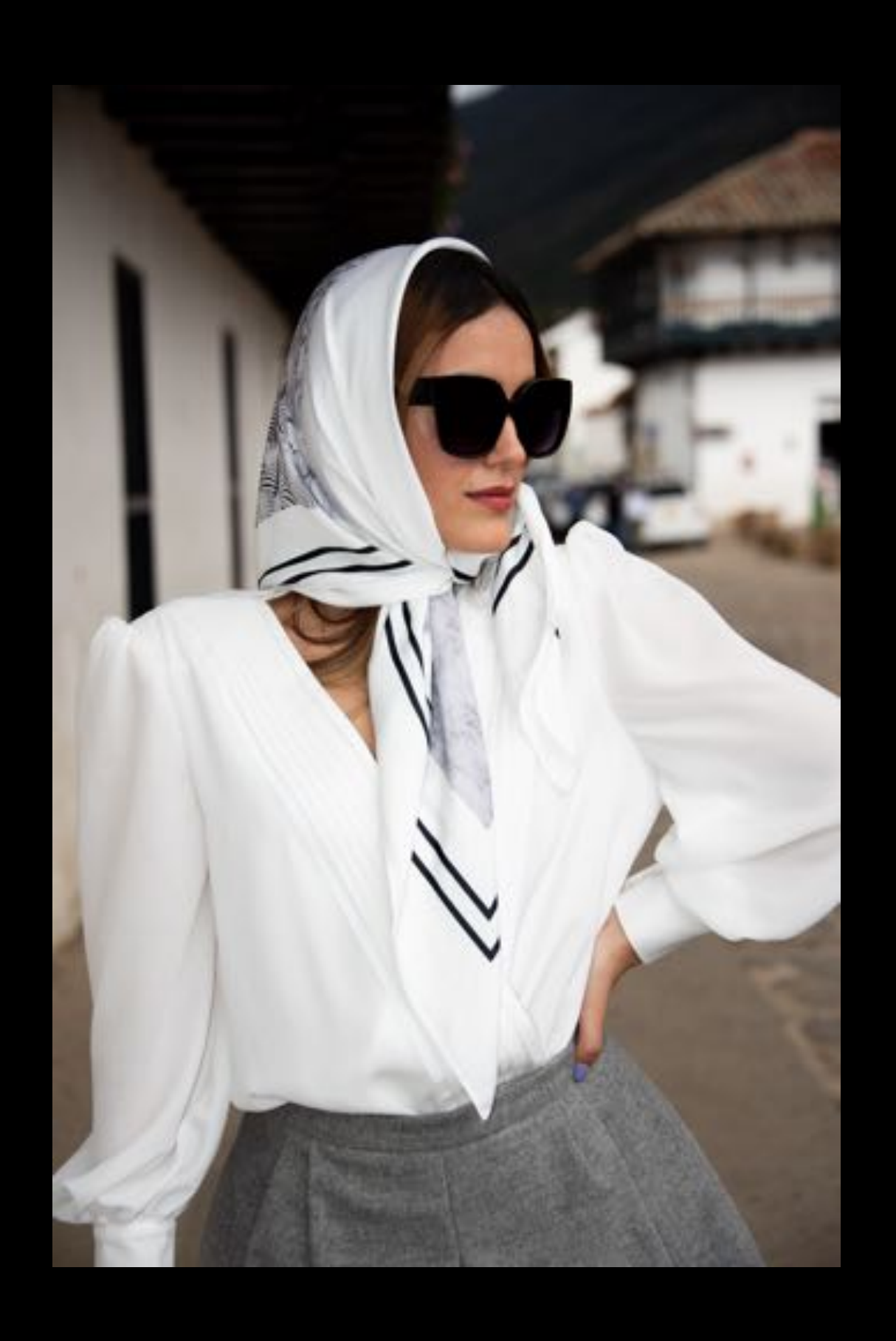
Denise Body Blouse in Cream