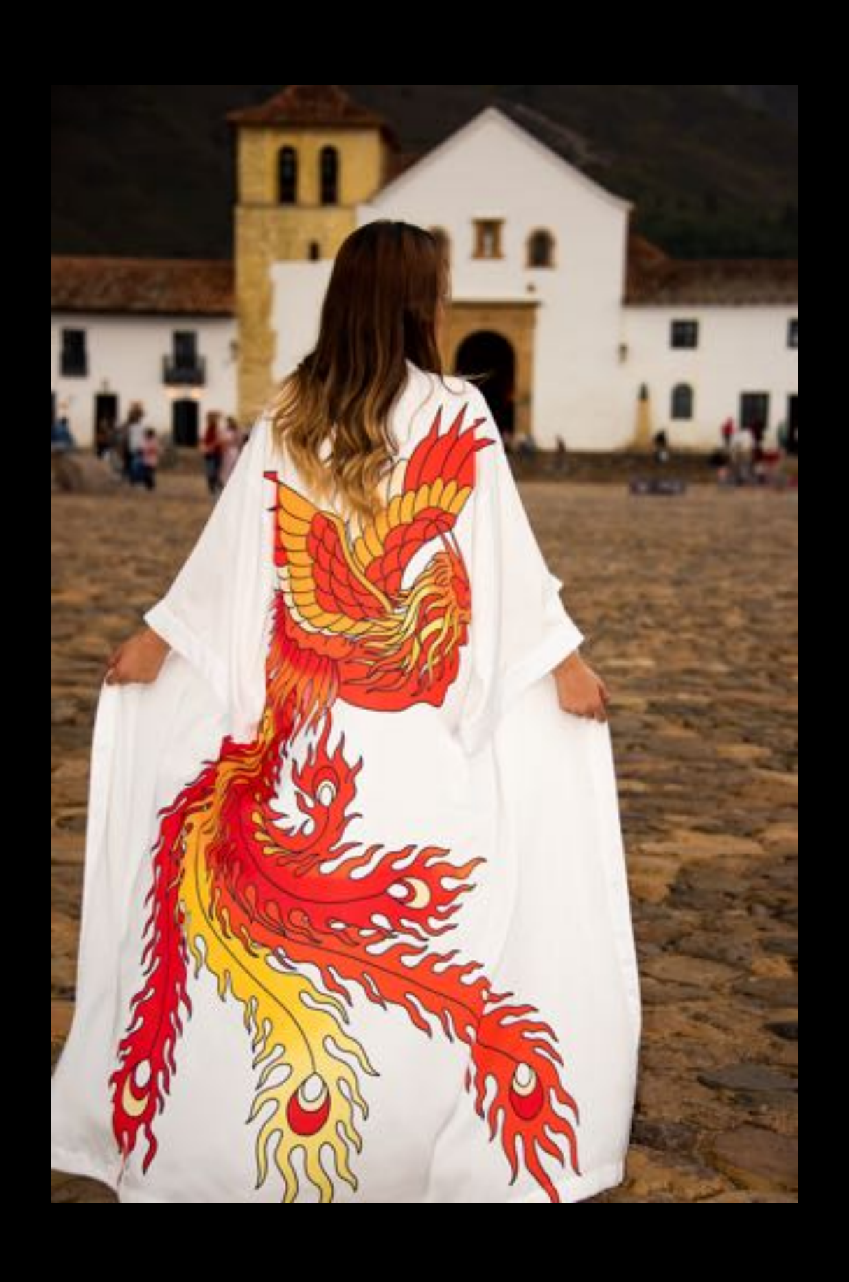
Katniss Unisex Kimono in Cream