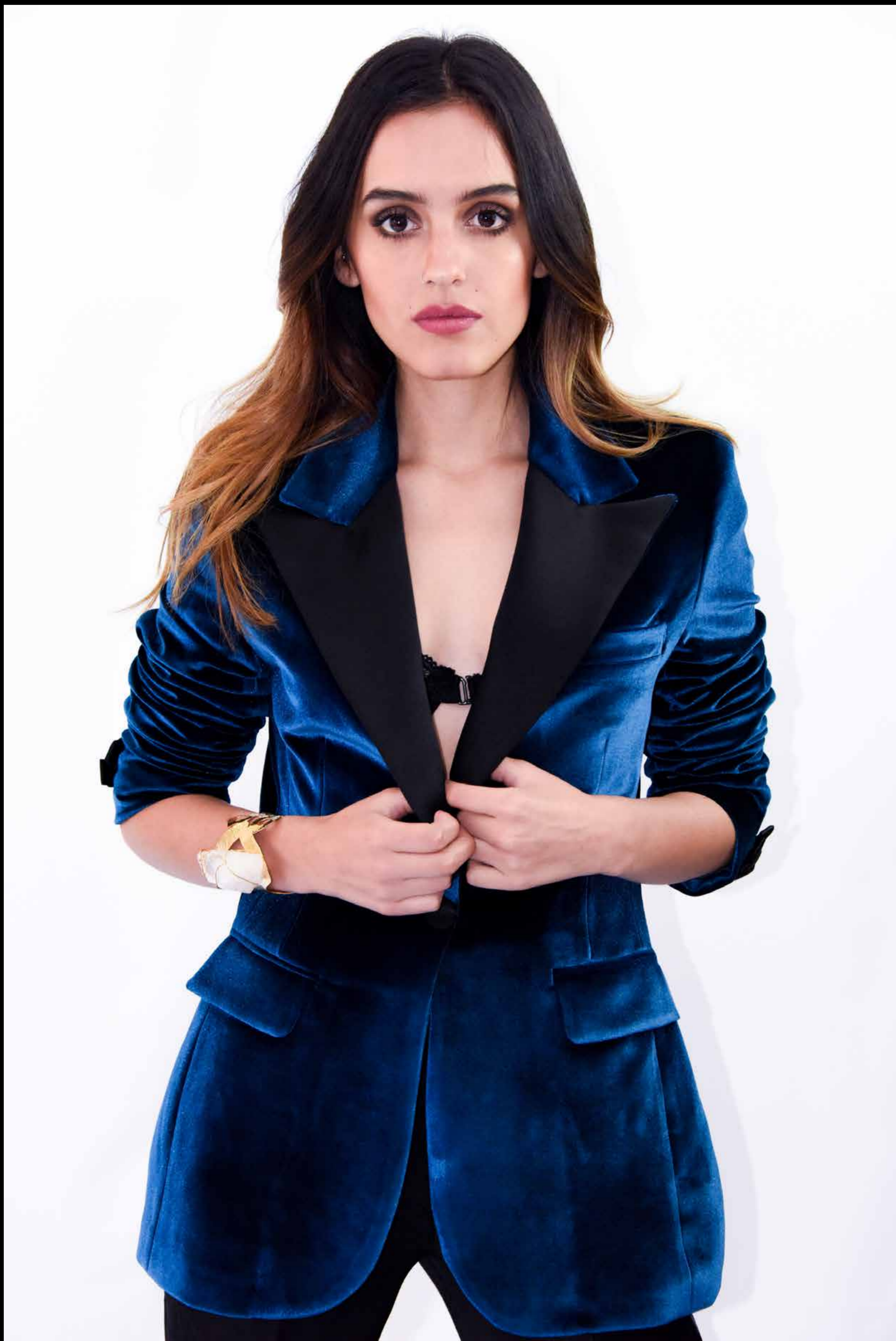
HER Signature Blue Velvet Blazer