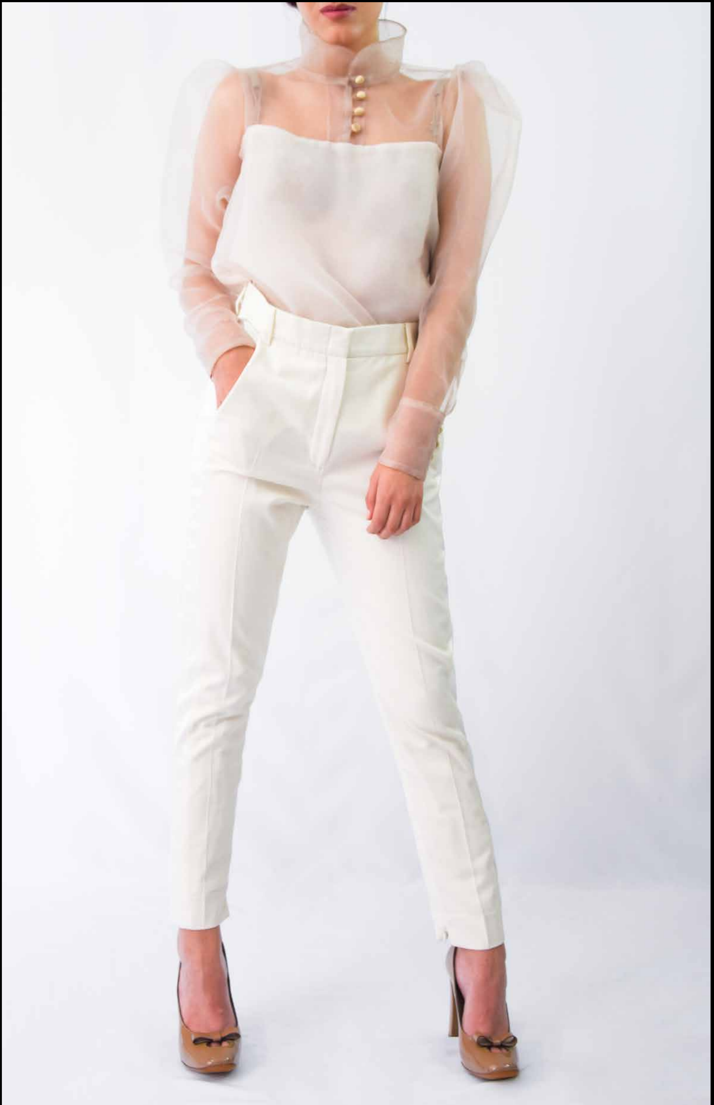
Claudette Cream Wool Trousers