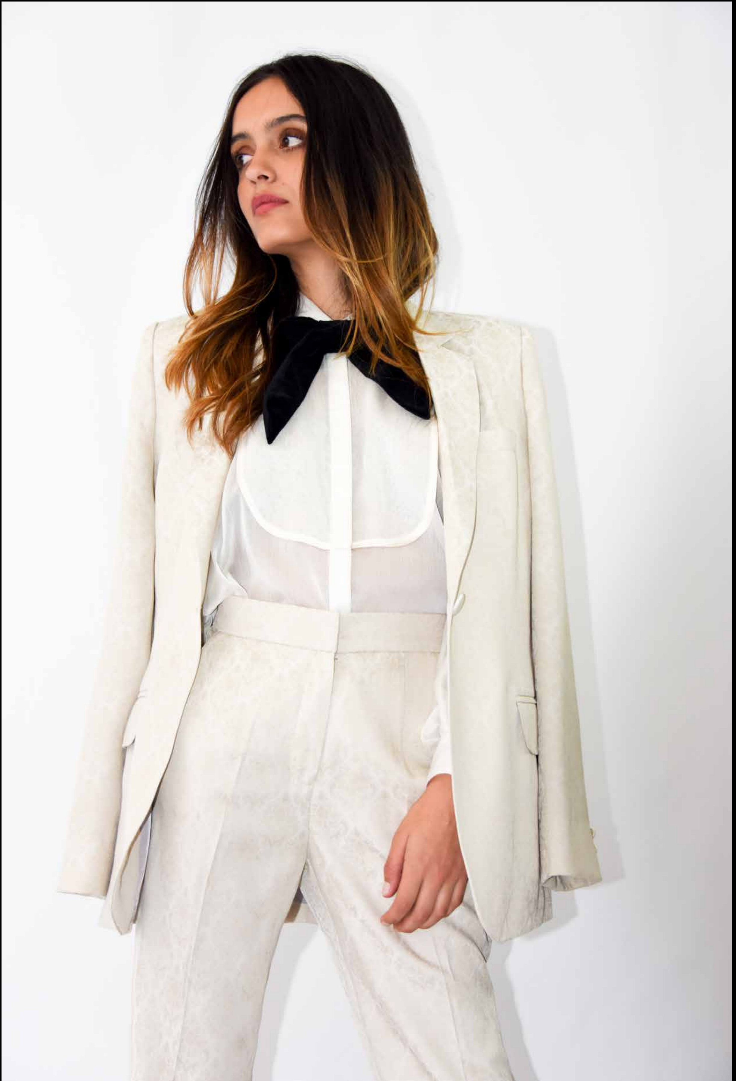
Josephine Silk Blazer