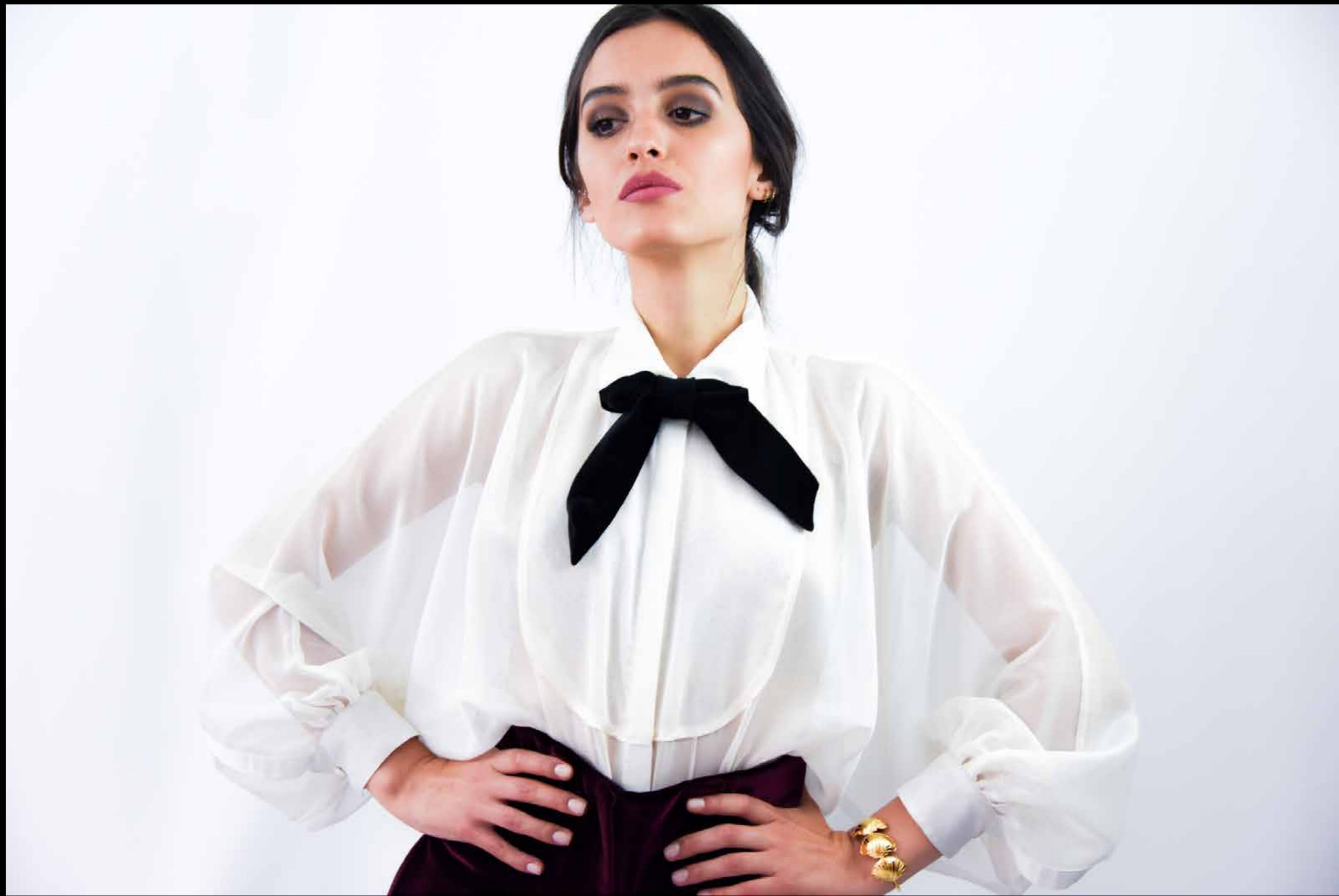
Madeleine Kimono Blouse with Velvet Bow