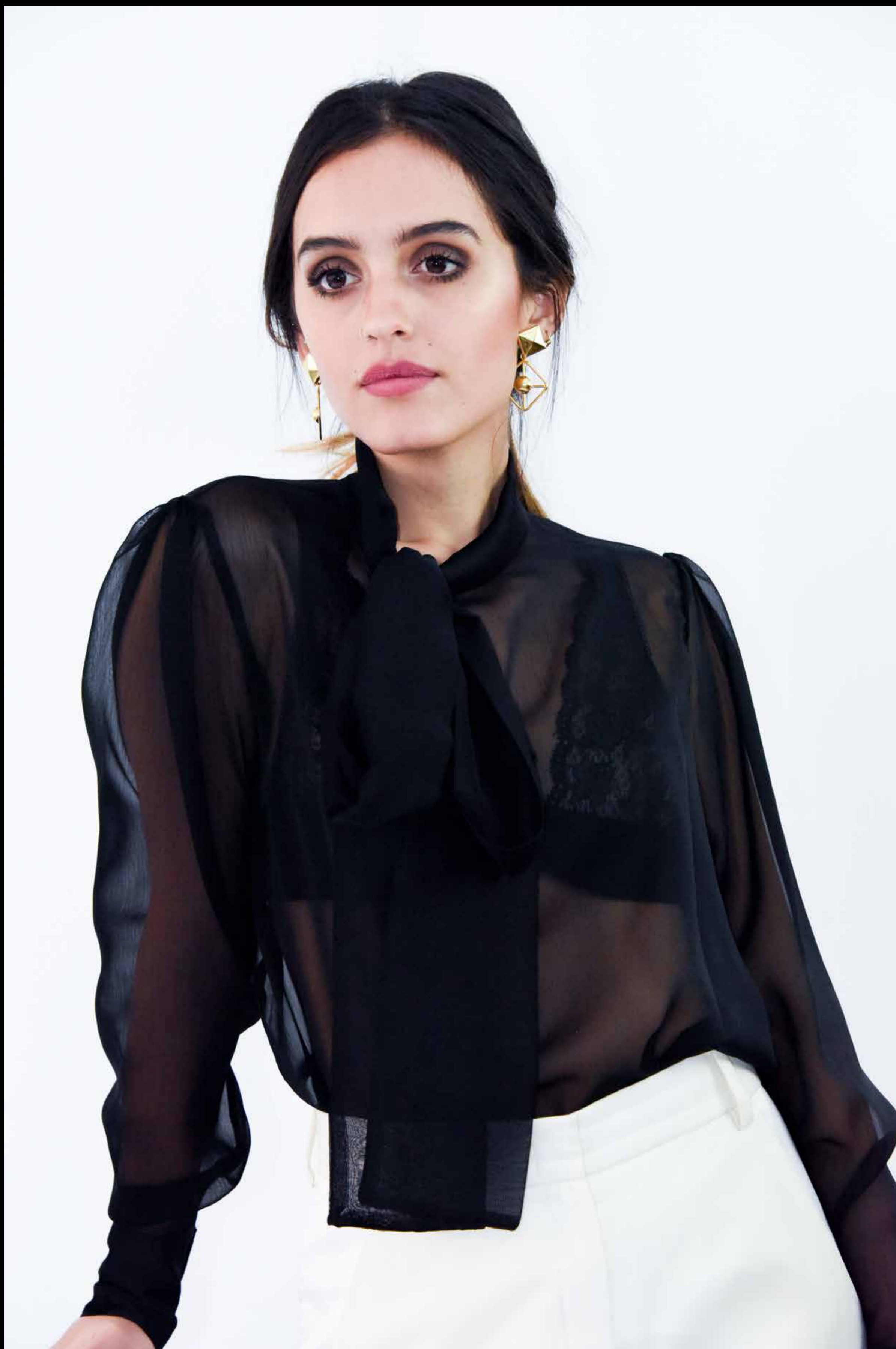
Mila Black Silk Blouse