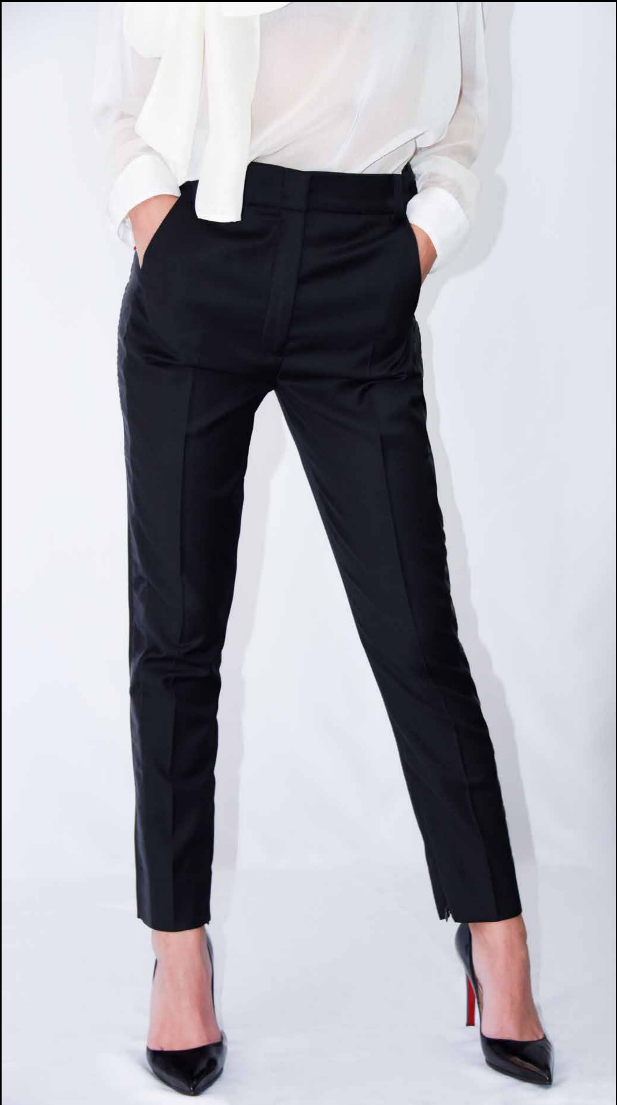
Claudette Black Wool Trouser