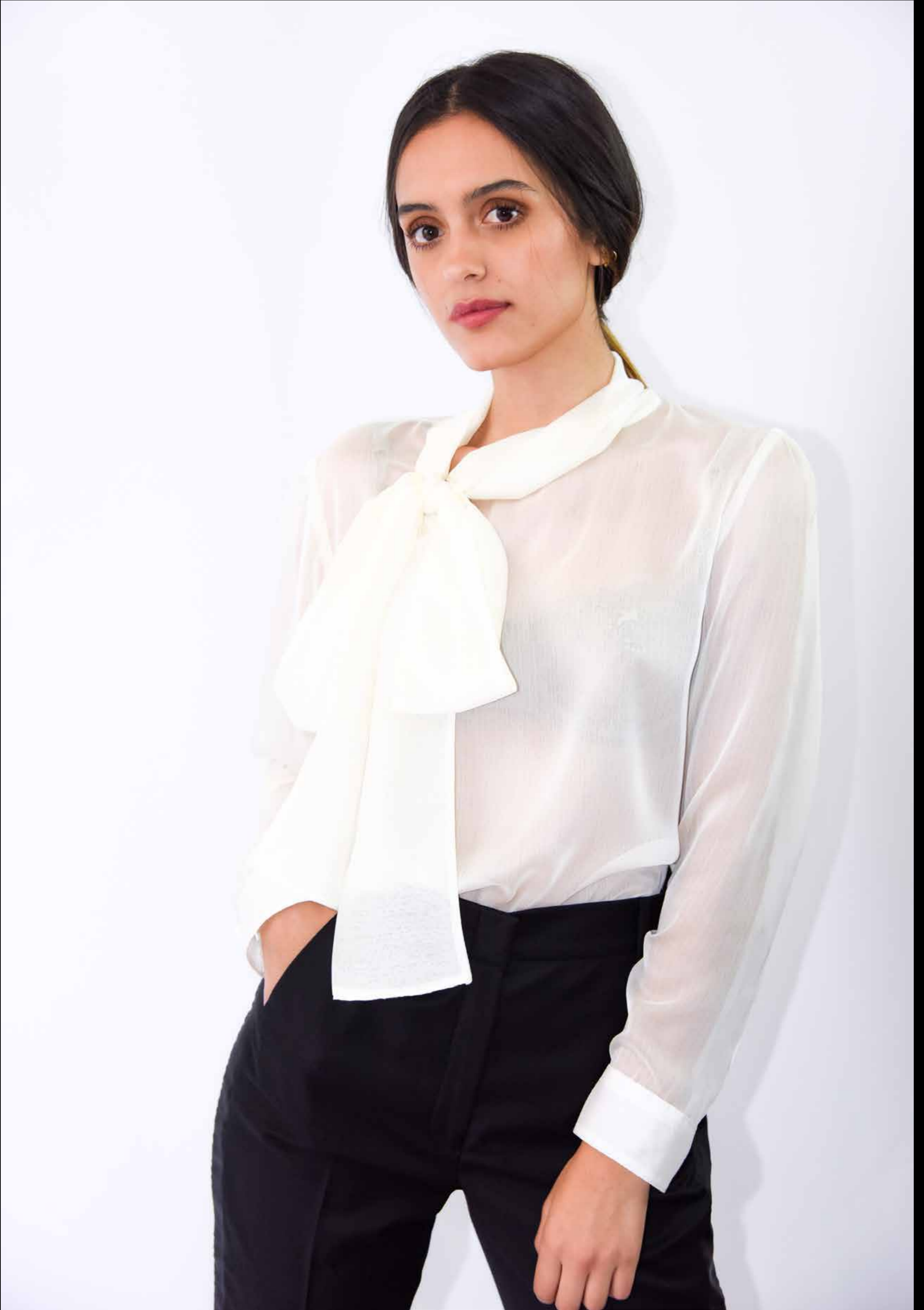
Mila Cream Silk Blouse