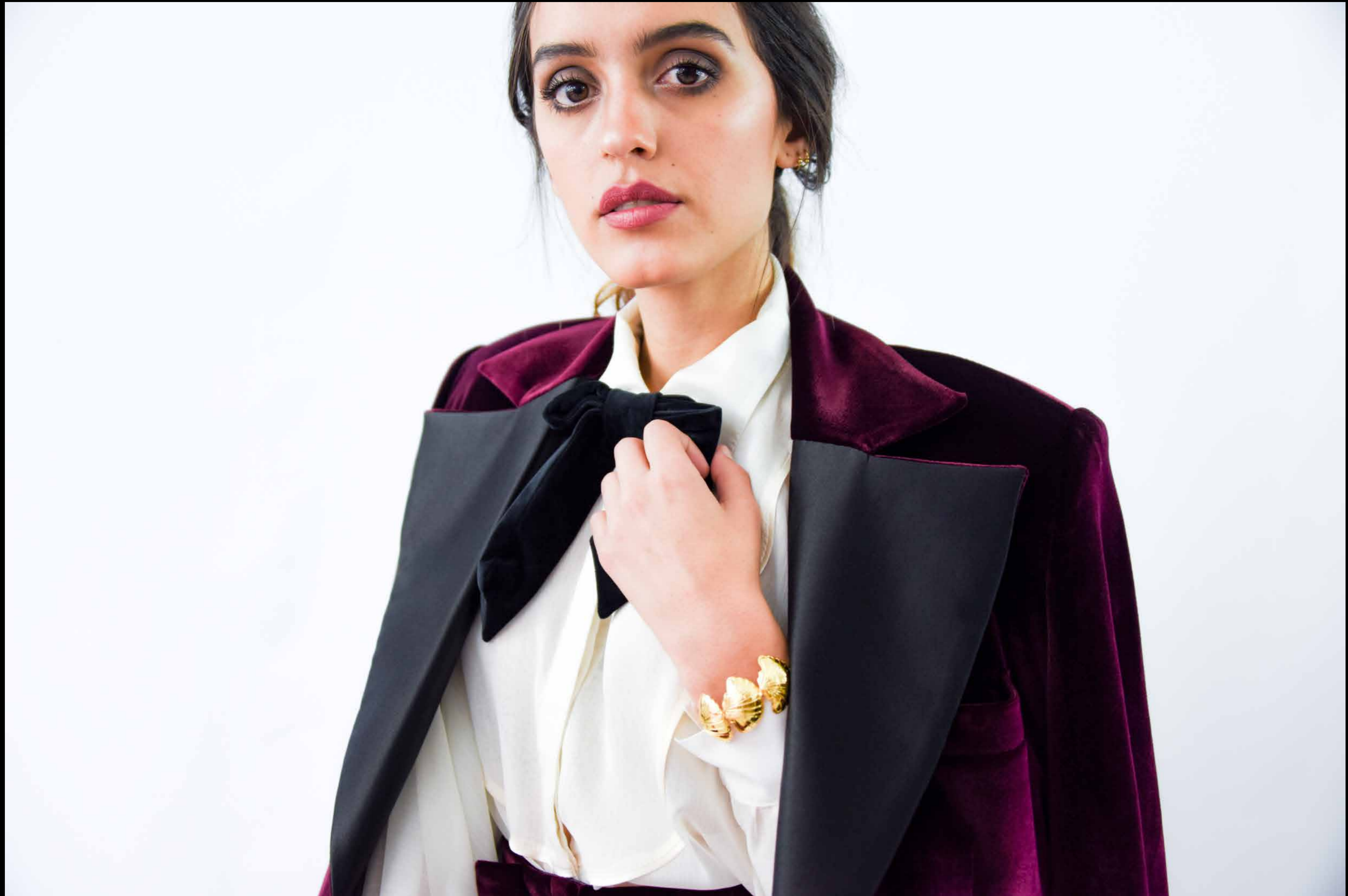
HER Signature Blazer in Burgundy Velvet