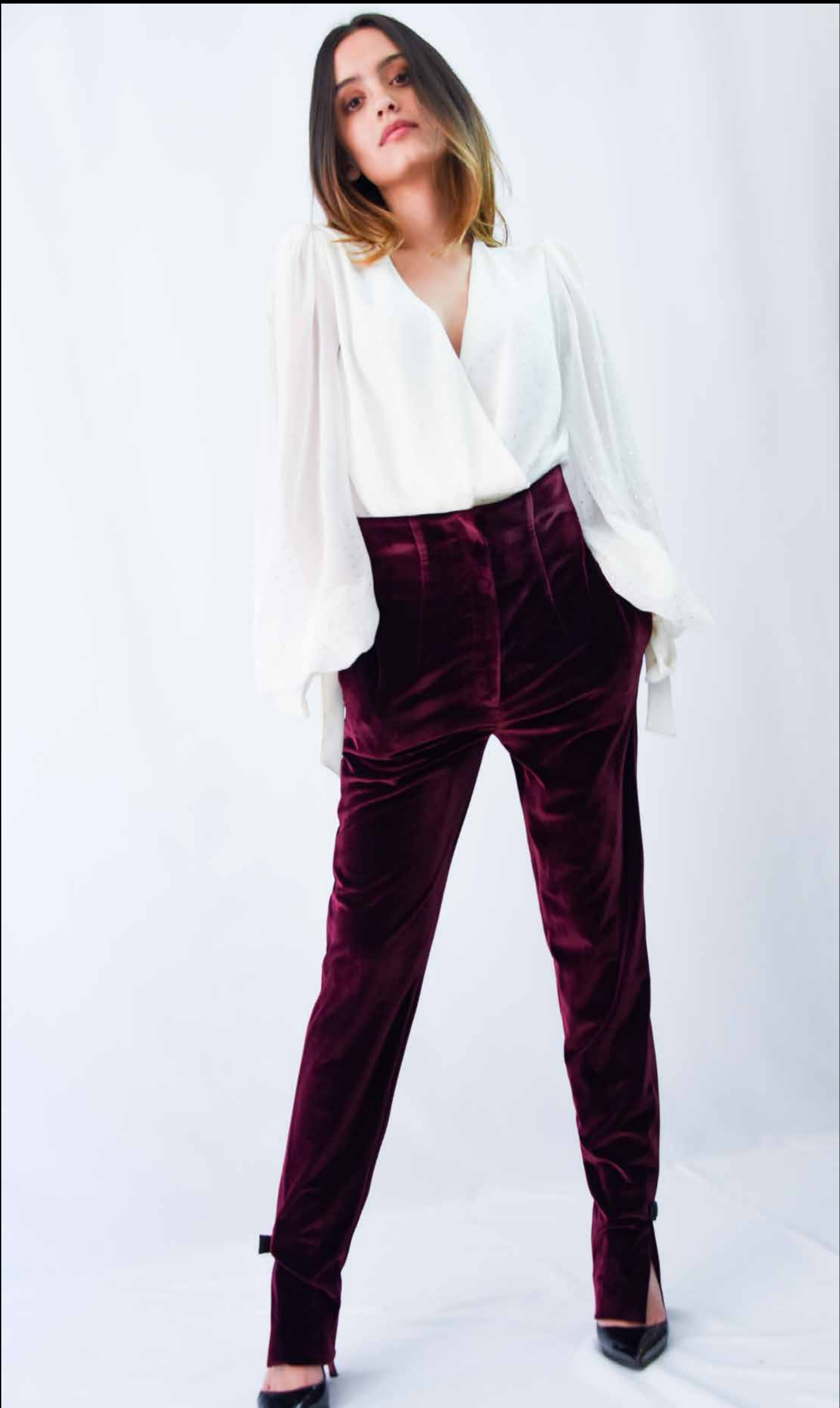
Mademoiselle High Waisted Velvet Trousers