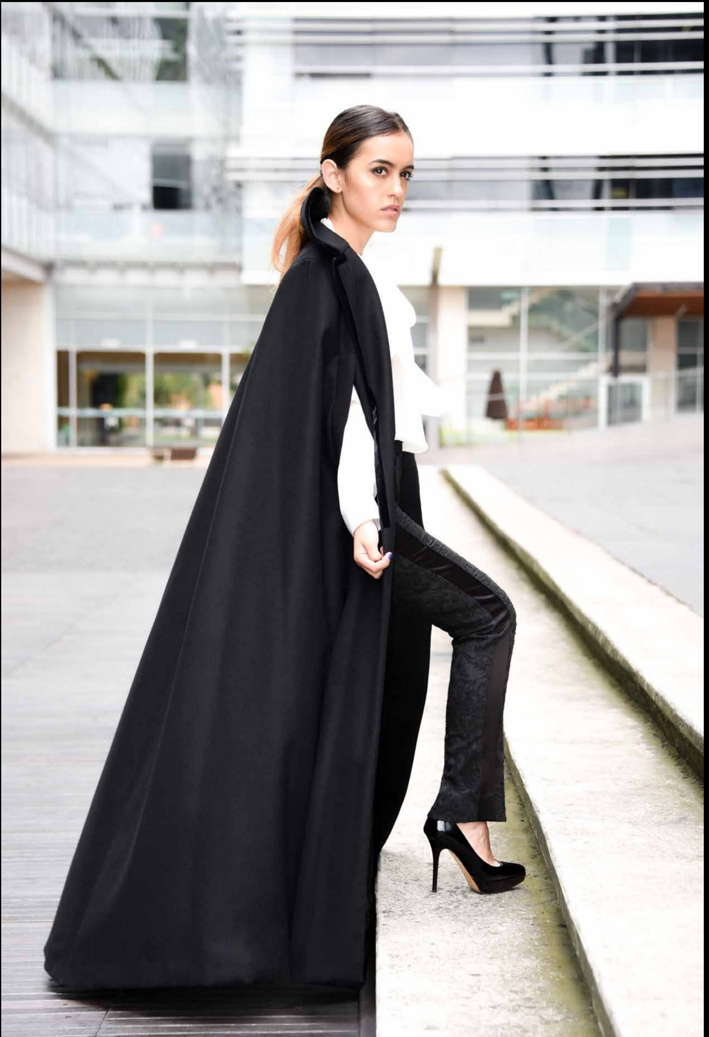
Laurent Black Alpaca Cape