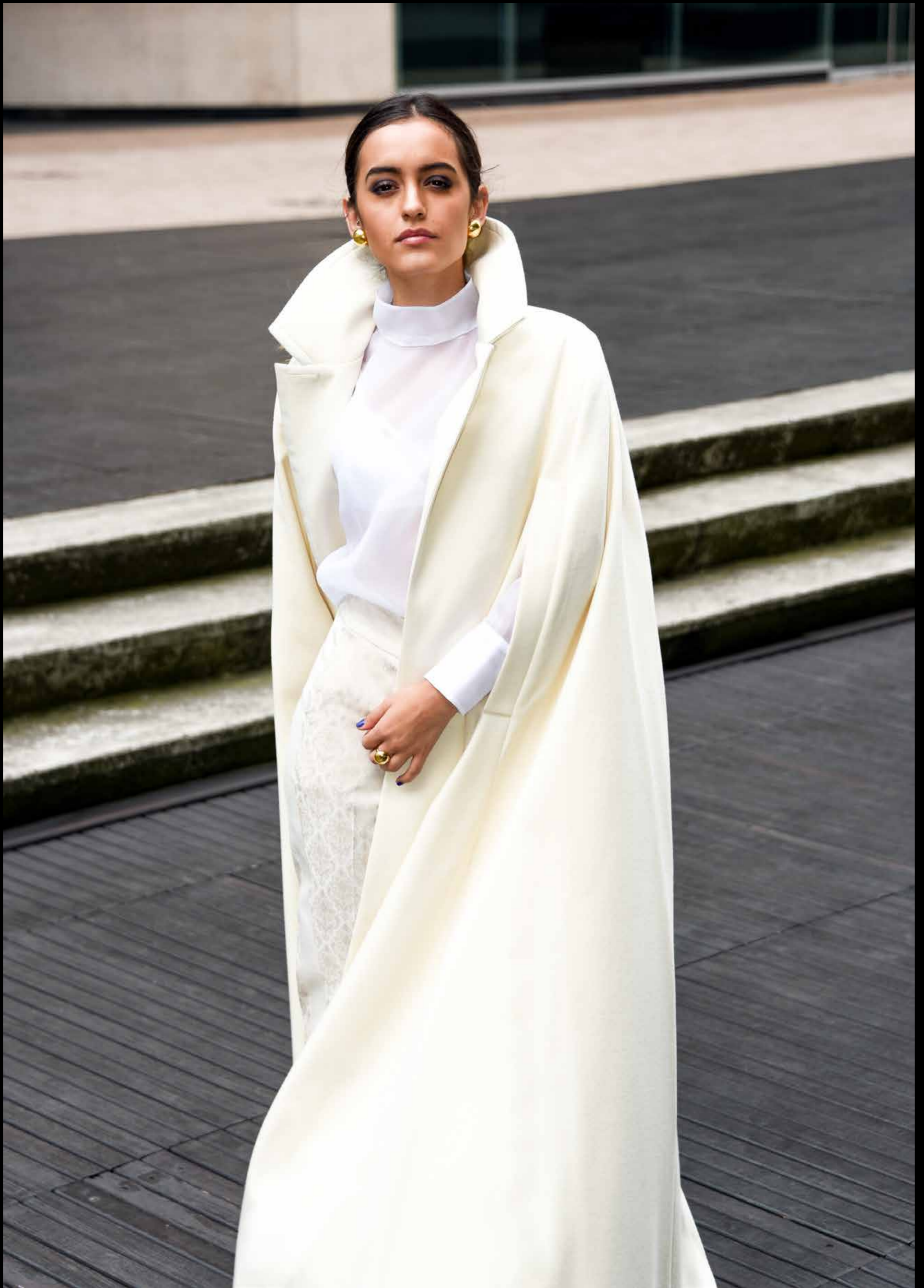
Laurent Cream Alpaca Cape