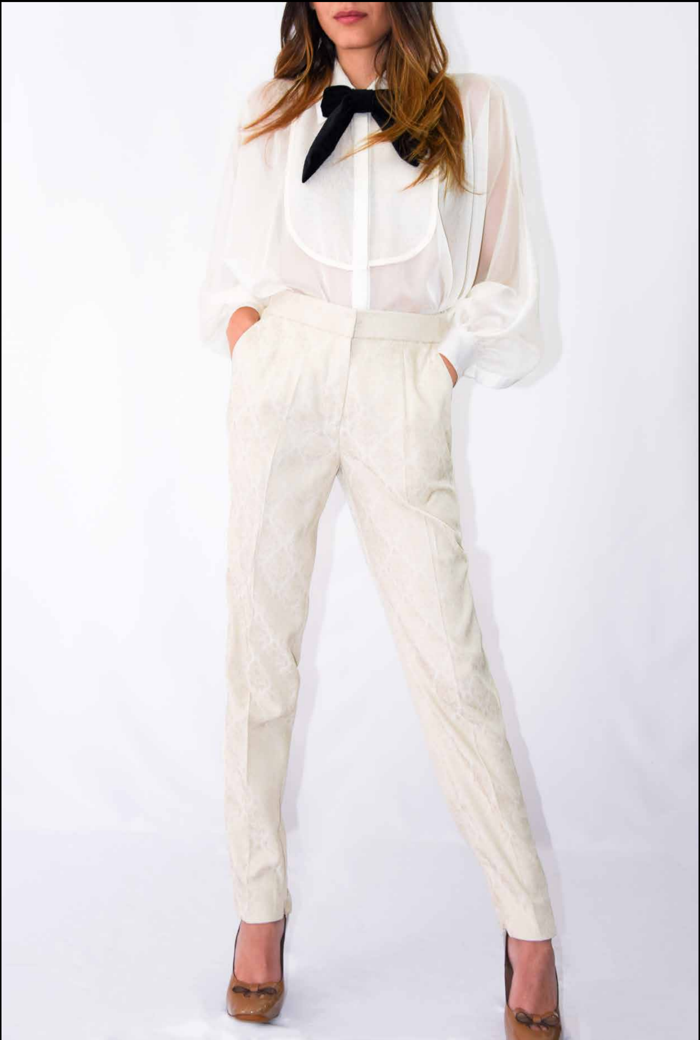
Ella Silk Trouser