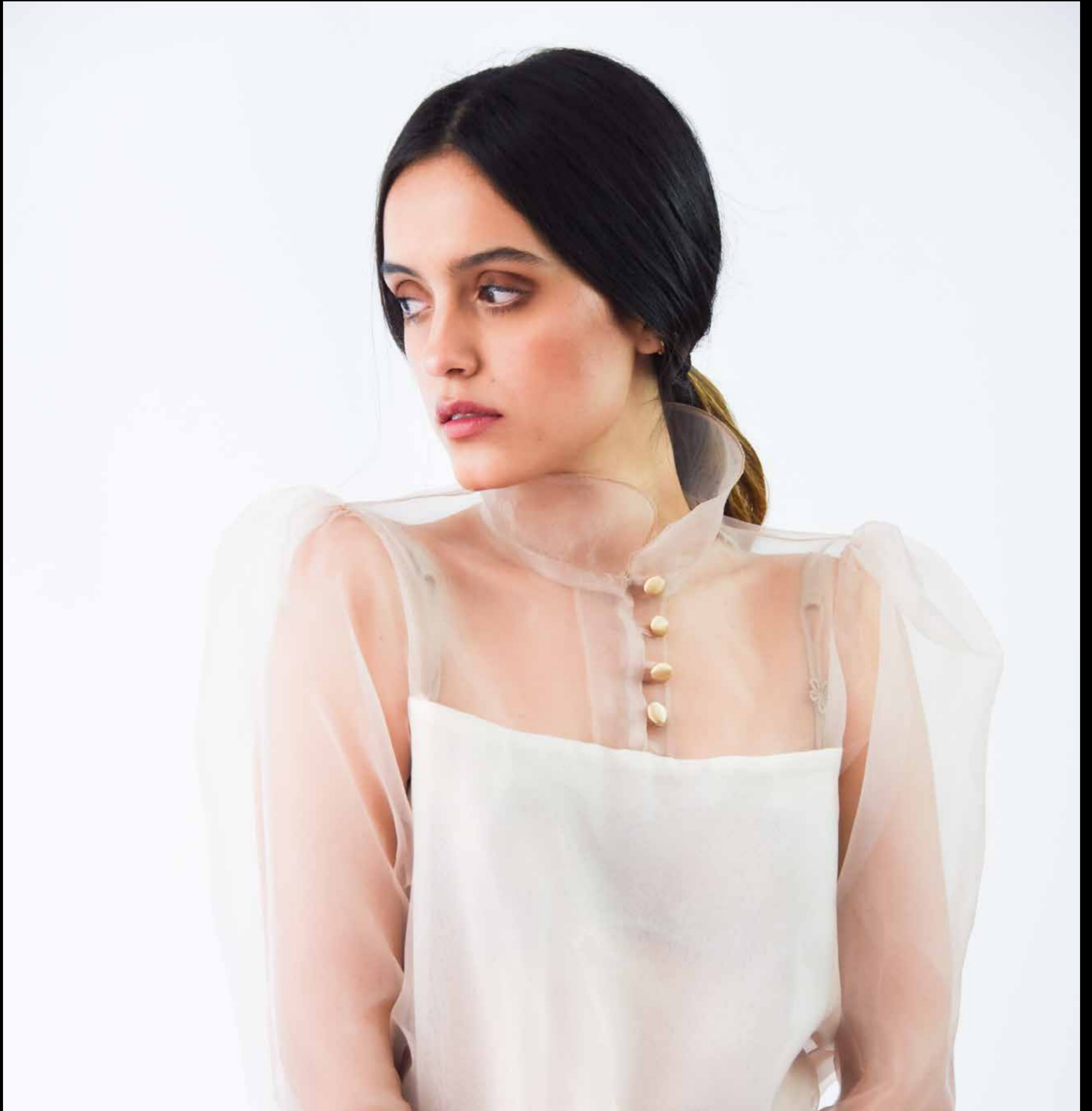
Mathilda Nude Organza Blouse