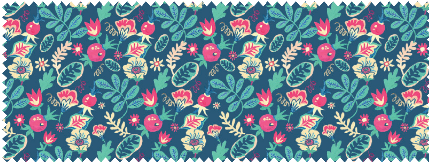
Beach Berries 05546262A

Composition: 78% Recycled Polyamide, 22% Eastane