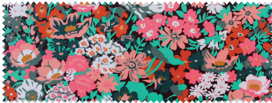
Thorpe B 05548260B

Composition: 78% Recycled Nylon, 22% Xtra Life LYCRA®