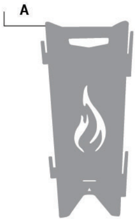
1 X START PANEL