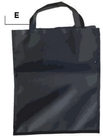
1 X CARRY BAG

02 Find panel "A", there is an arrow on the bottom of the panel. Following the arrow direction, connect panel "A" with first middle panel "B".