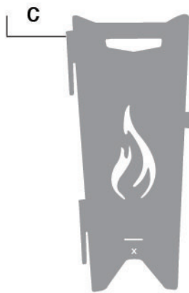
1 X END PANEL