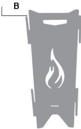
6 X MIDDLE PANELS