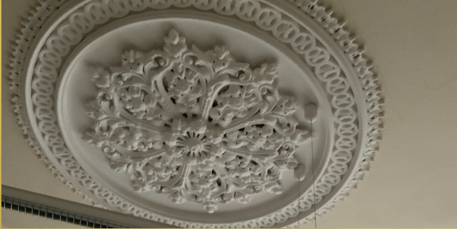
Plaster and lath

Enviro cable protection sleeve for every scenario