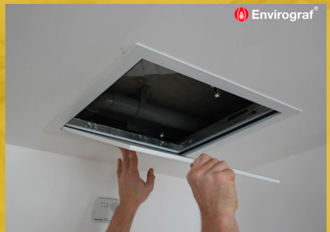
Access panels and hatches

Full product range available at https://envirografireland.com/collections or request a catalogue