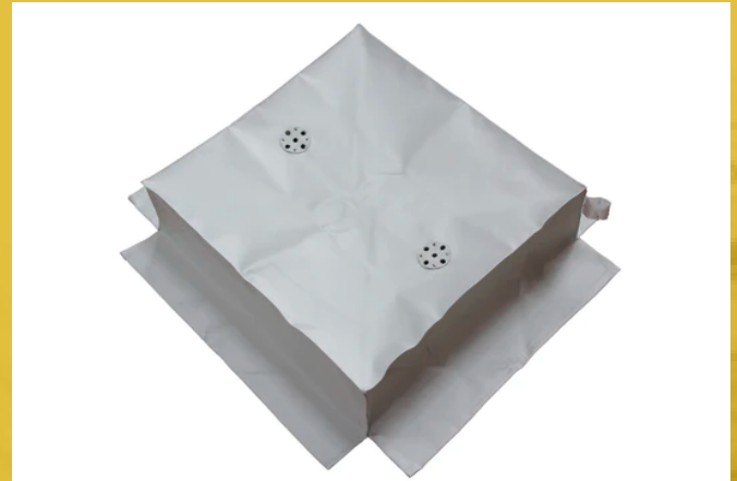
Downlighters and air conditioning covers