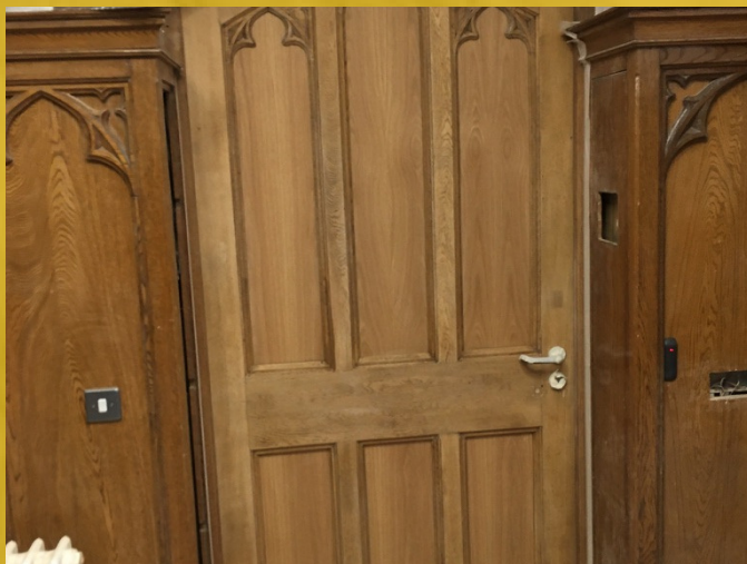
Coating for door upgrades & paneling