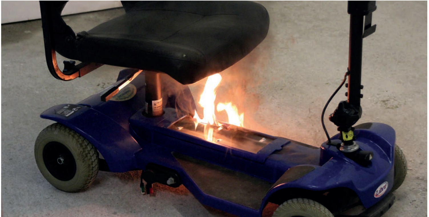
MOBILITY SCOOTER BATTERY FIRE WITHOUT PROTECTION