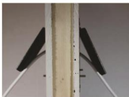
Wall section top view open.

Multiple cables can be passed through. When cables are removed the sponge will return to its original shape.