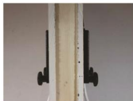
Wall section top view closed.