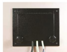
You can put multiple cables through.