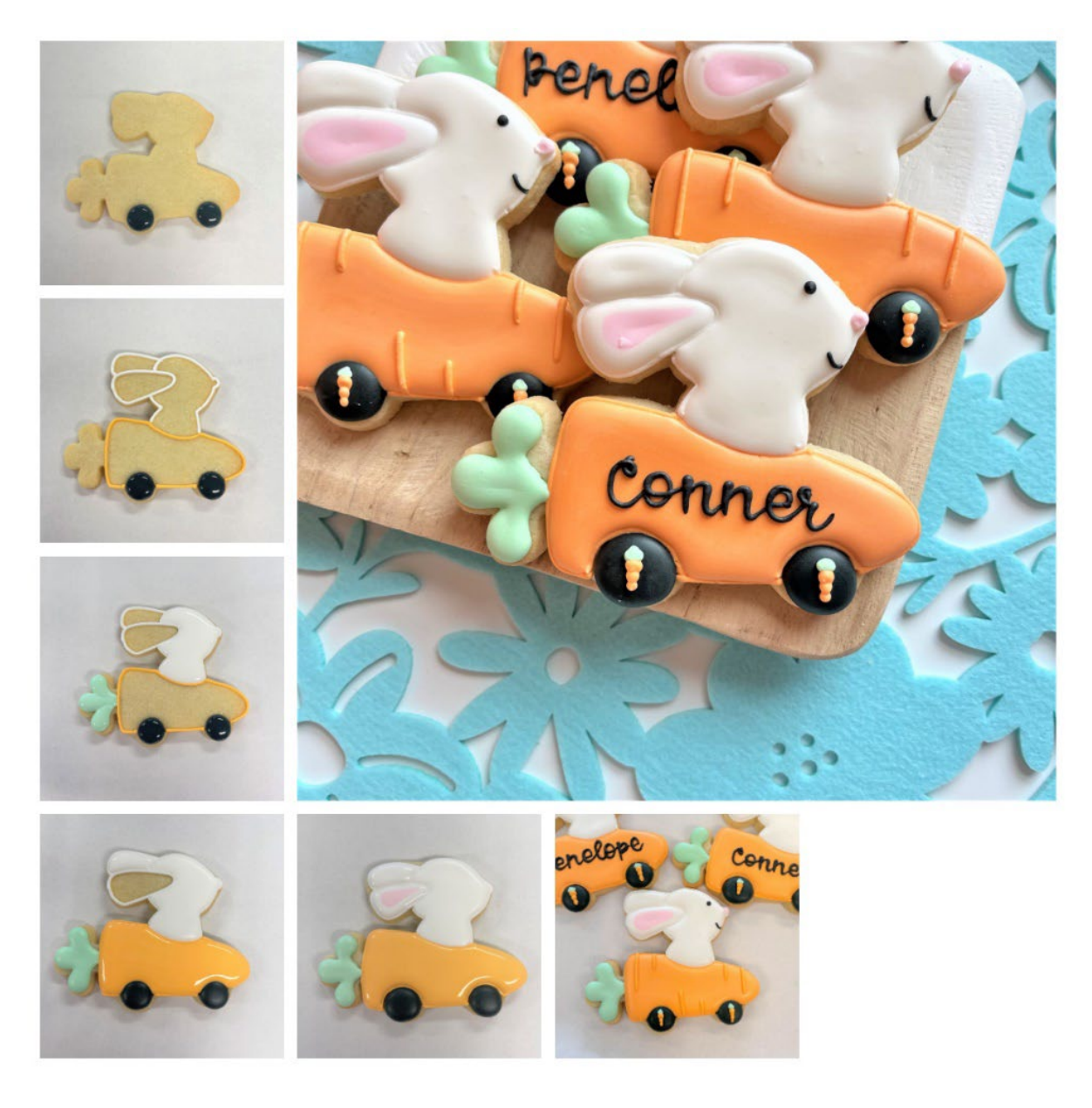
Icing Colors: Sunset Orange, White, Rose Pink, Black Diamond, Mint Green

The font used on the carrot is called Girl Talk Regular.