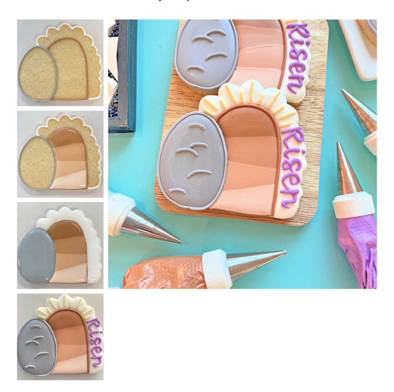
Icing Colors: Black Diamond (a very tiny dot to make gray), Gold, Buckeye Brown (in 4 shades of flood), Purple, and White.

See the last page for a template for the words risen. The font used is called Girl Talk.