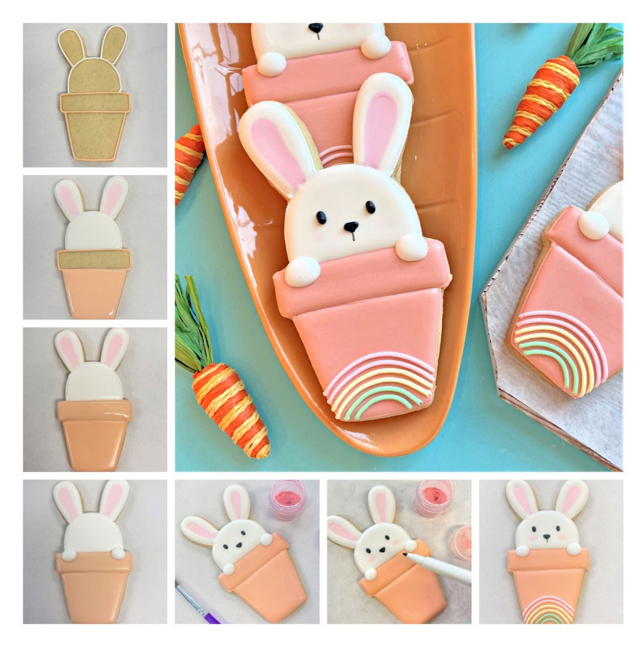
I used Carnation Pink Crystal Color and a round brush to blush the cheeks and a black food marker for the small mouth detail.

Icing Colors: Sienna, White, Rose Pink, Lemon Yellow, Mini Green, Black Diamond.