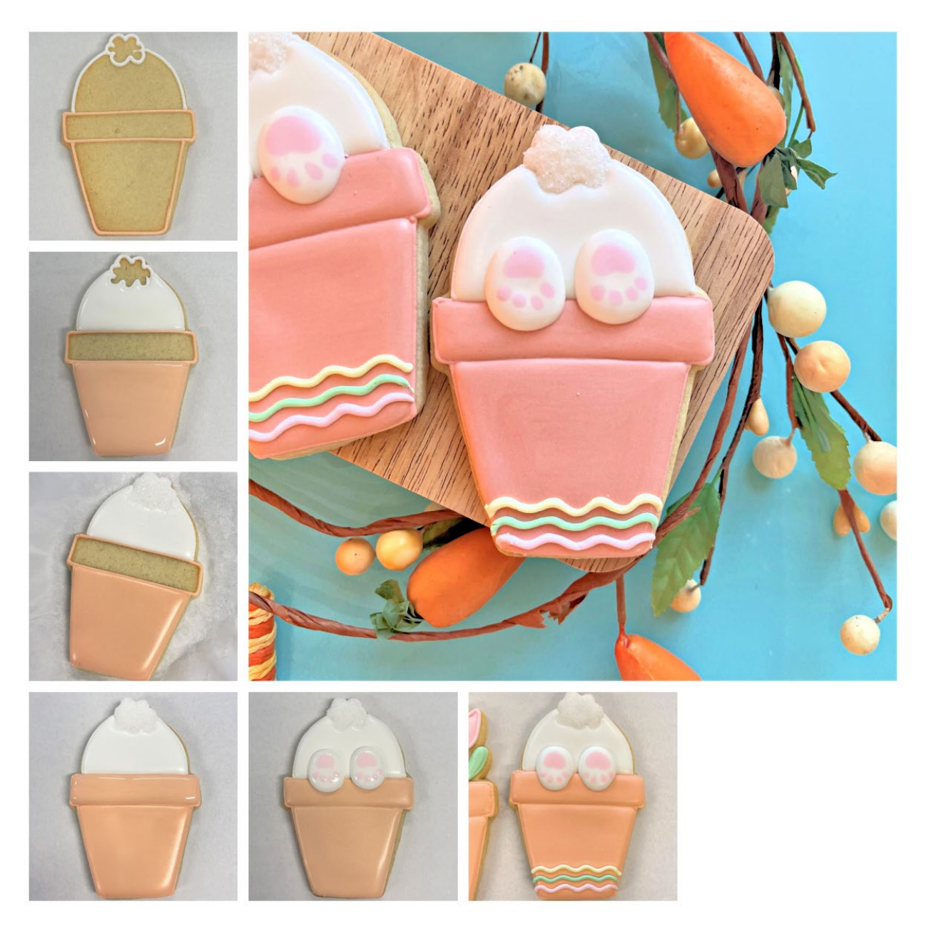
I used white sanding sugar on the bunny tail.

Icing Colors: Sienna, White, Rose Pink, Lemon Yellow, and Mini Green