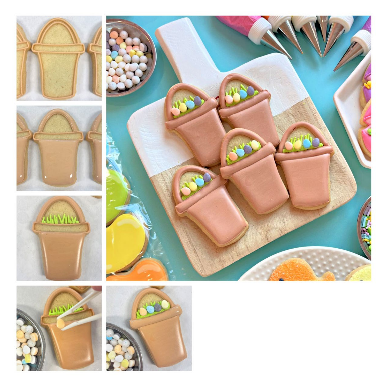
I used the Bright Pastel Rainbow Easter Egg and Jimmies Sprinkle Mix on these cookies.

Icing Colors: Buckeye Brown and Neon Green