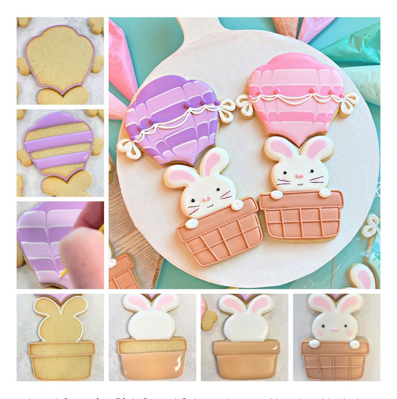
I used Carnation Pink Crystal Color and a round brush to blush the cheeks and a black food marker for the whisker detail.

Icing Colors: White, Buckeye Brown, Rose Pink (2 shades), Yellow (2 shades), Black Diamond, Purple (2 shades), and Turquoise (2 shades)