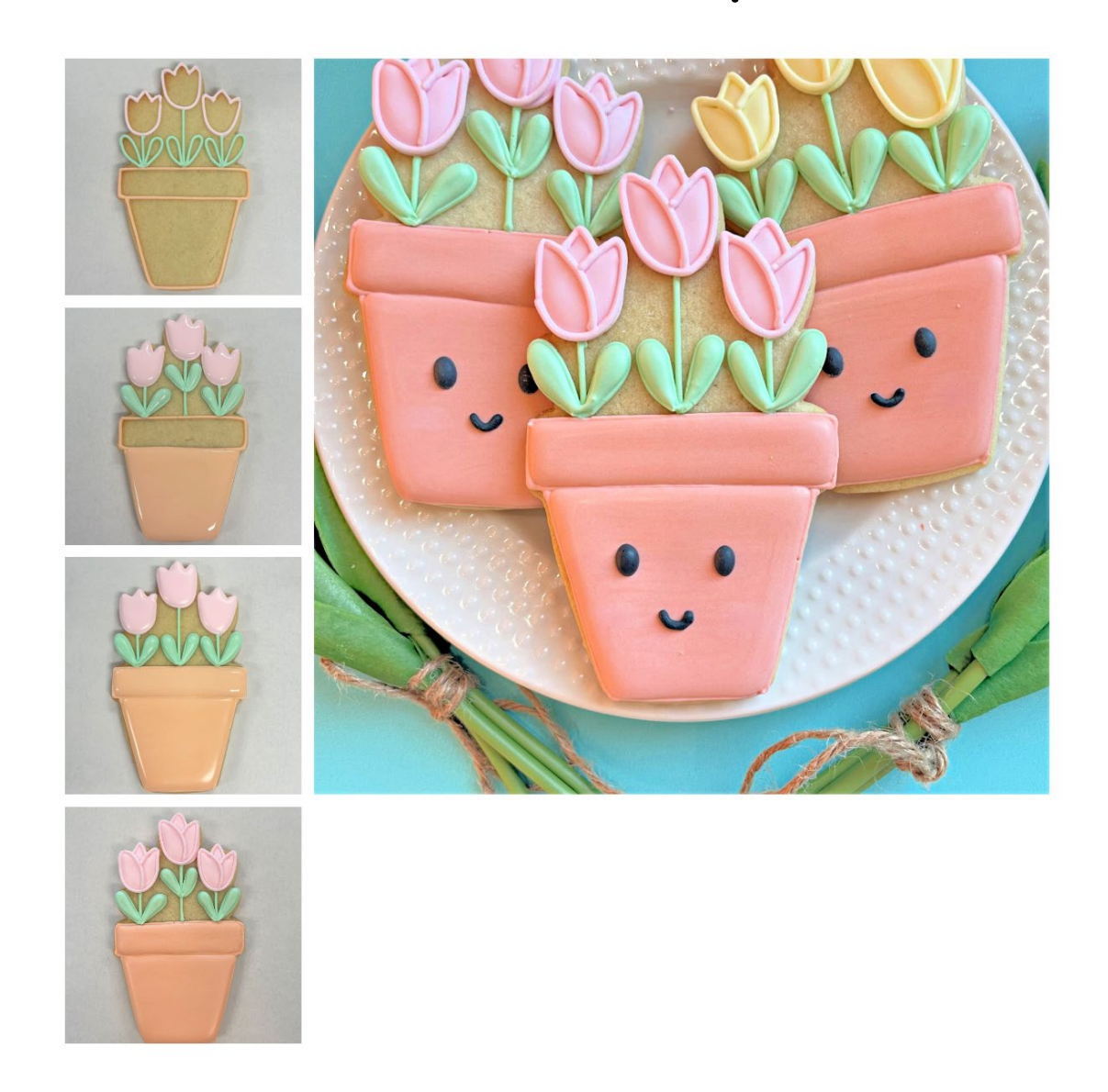
Icing Colors: Sienna, Rose Pink, Mint Green, Lemon Yellow, and Black Diamond