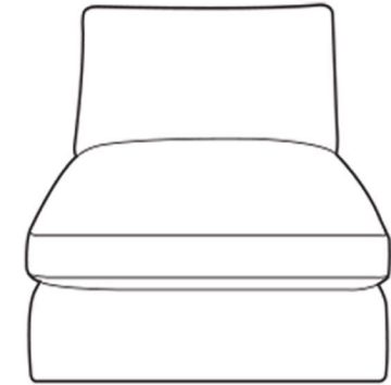
Armless W99 H91 D119cm