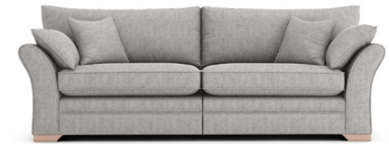
XL SPLIT SOFA