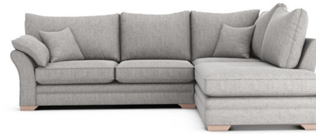
CORNER GROUP LHF