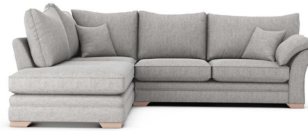
CORNER GROUP RHF