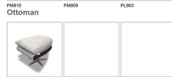
718 Technical Sheet Revision 01 Rif PR08 ST01/00 page 1/3