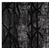
cotton chenille Mumbai