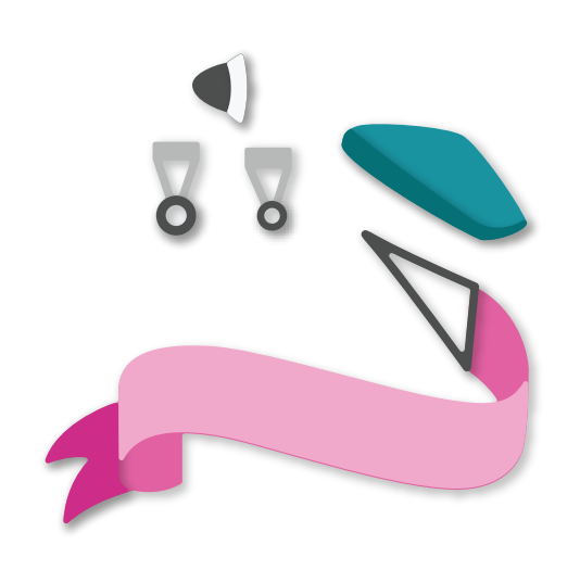
2. Attach the layer pieces to the plane nose, landing gear, large wing, and banner.