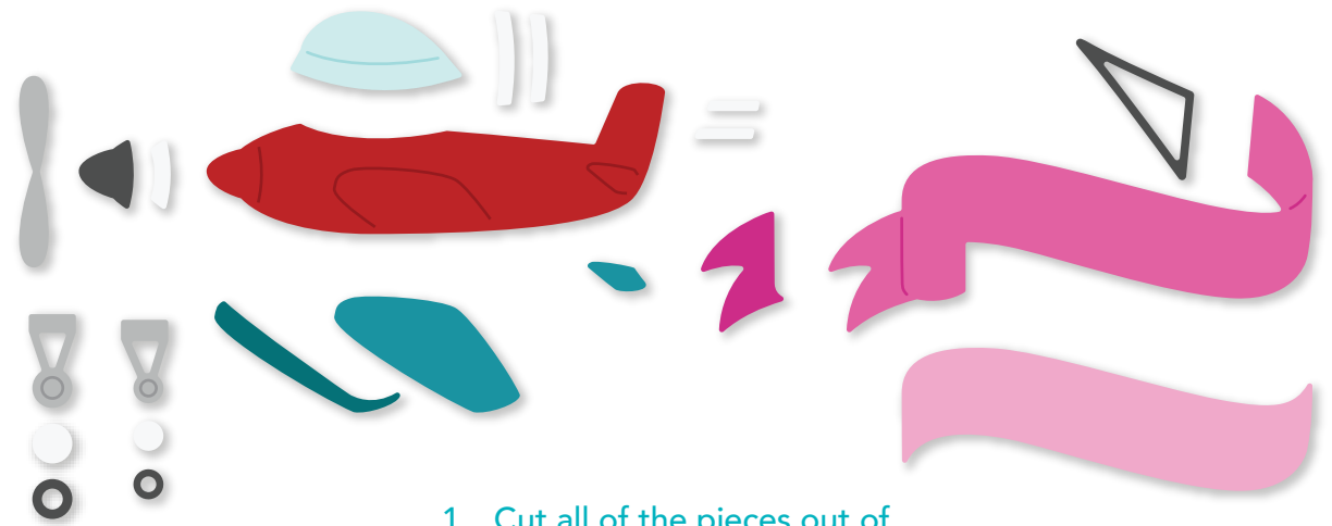
1. Cut all of the pieces out of desired card stock.