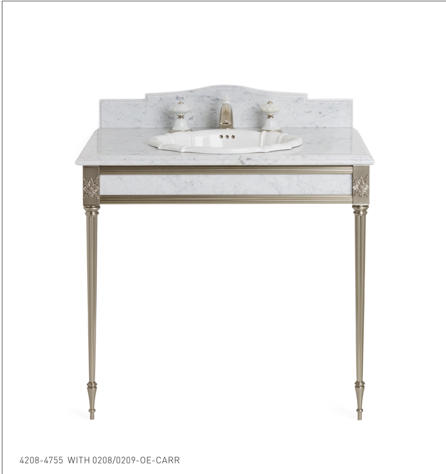
4208-4755 WITH 0208/0209-OE-CARR

STONE CONSOLE TOP, BACK SPLASH, FRONT AND SIDE PANELS 0208-0209-XXXX-XXXX