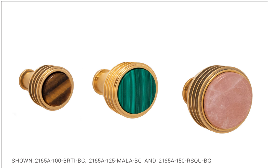
SHOWN: 2165A-100-BRTI-BG, 2165A-125-MALA-BG AND 2165A-150-RSQU-BG

STONE INSERT KEYSTONE CABINET AND DRAWER KNOB SMALL 2165A-100-XXXX-XX STONE INSERT KEYSTONE CABINET AND DRAWER KNOB MEDIUM 2165A-125-XXXX-XX STONE INSERT KEYSTONE CABINET AND DRAWER KNOB LARGE 2165A-150-XXXX-XX