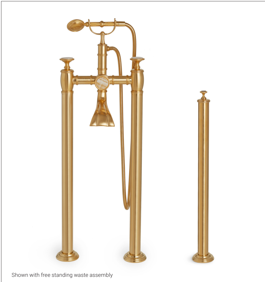
Shown with free standing waste assembly

Stone Knurled Knob Exposed Tub Set 1065XTS-01-XXXX-XX Exposed Free Standing Waste Assembly with Stone Knurled Pull XP-WASTE-1034-112-XXXX-XX