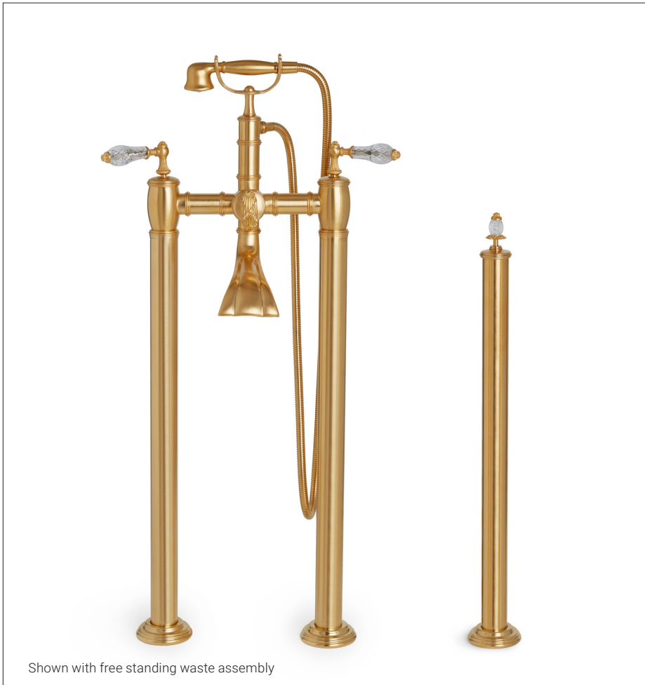
Shown with free standing waste assembly

Exposed Free Standing Waste Assembly with Cut Crystal Pineapple Pull XP-WASTE-1001-CTCR-XX