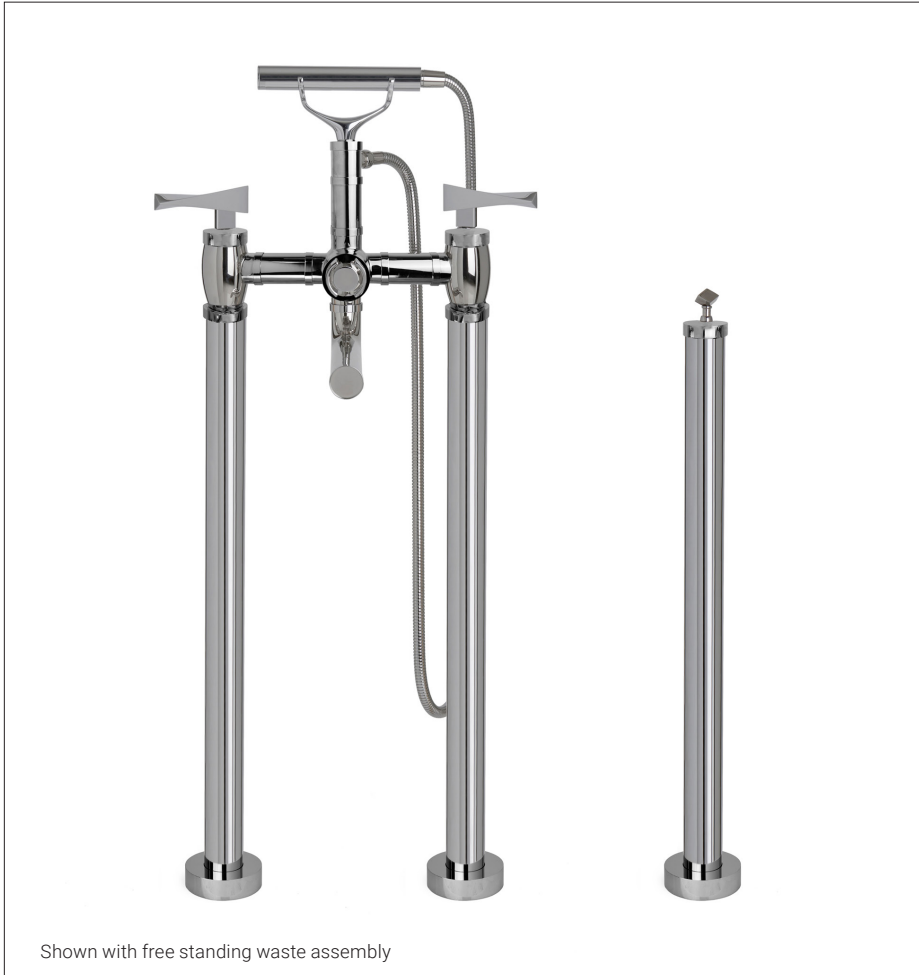
Shown with free standing waste assembly

Modern Exposed Free Standing Waste Assembly with Tangent Pull XP-WASTE-1091-XX