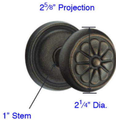
Petal (PT) with #12 Rosette