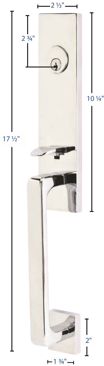
Davos Style Part # 4818