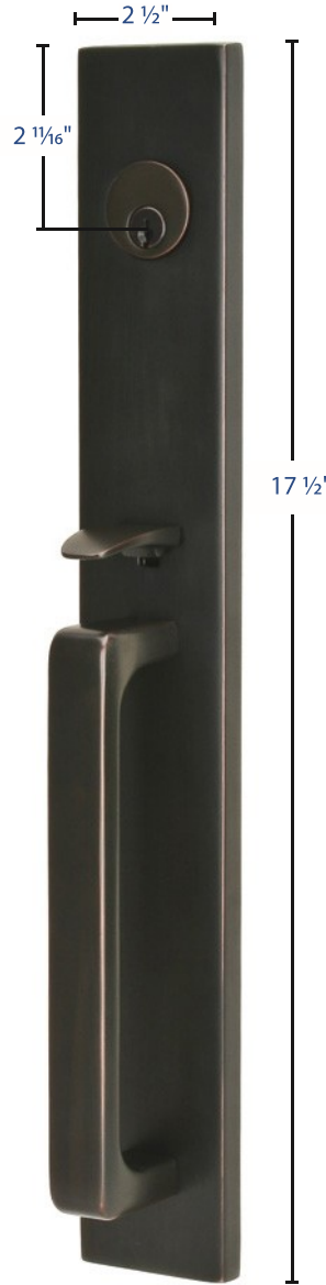
Lausanne Style Part # 4819