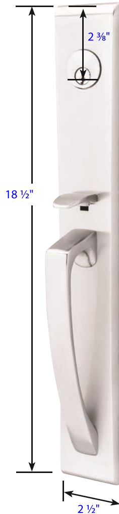
Orion Style Part # 4816