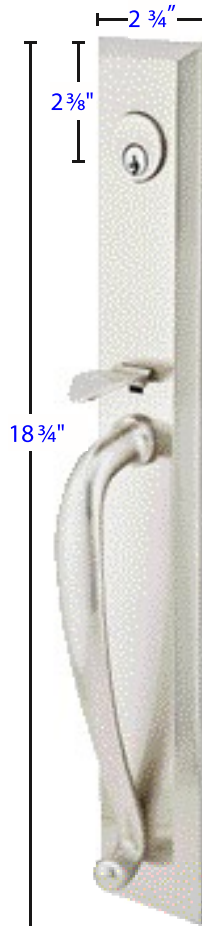
Jefferson Trim Style Part # 4415