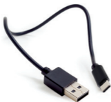
Type C Charging Cable