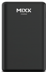
MIXX Ultra Fast Power Bank