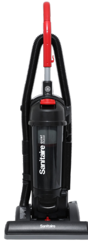
FORCE® QuietClean® Upright Vacuum MFG # SC5845D | 60NP75