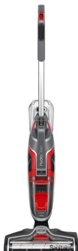
HydroClean™ Hard Floor Washer MFG # SC930A | 784ZV5

Introducing the Sanitaire® HYDROCLEAN® Hard Floor Washer + Vacuum. The only machine you'll need to clean hard floors. Clean with speed and ease. This timesaving tool does it all – vacuums and washes in one step – no spray bottles, mops, buckets or cloths. Get more done in less time and flip critical spaces faster.