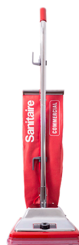
TRADITION® Upright Vacuum MFG # SC886G | 3U712

TRADITION® upright vacuums lower your cost of ownership with a 2,000 hour motor, chrome brush roll with replaceable bristle strips and a 50-foot cord for easier and cost-effective maintenance. Increase productivity with less downtime.