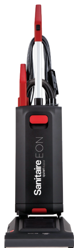
EON® QuietClean® Upright Vacuum MFG # SC5500B | 48XL30