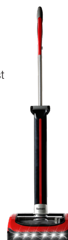
TRACER™ Cordless Vacuum MFG # SC7100A | 55WP10

Includes vacuum, removable battery, and battery charger.