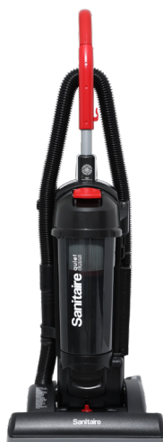
FORCE® QuietClean® Upright Vacuum MFG # SC5845D | 60NP75