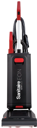
EON® QuietClean® Upright Vacuum MFG # SC5500B | 48XL30