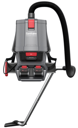
TRANSPORT® Cordless Backpack Vacuum MFG # SC580A

*Versus Sanitaire® EON® QuietClean® Corded Vacuum SC5500A, ACIS Commercial Vacuum Cleaner Time and Motion Study 2016.