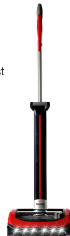
TRACER™ Cordless Vacuum MFG # SC7100A | 55WP10

Includes vacuum, removable battery, and battery charger.