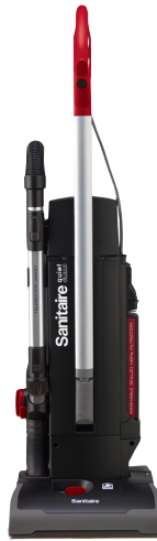
MULTI-SURFACE QuietClean® Upright Vacuum MFG # SC9180B | 1TGZ5