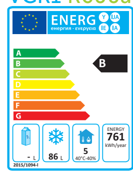
Energy rating per drawer module