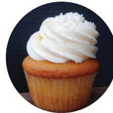
VANILLA W/ VANILLA BUTTERCREAM