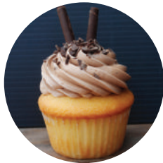
VANILLA W/ CHOCOLATE BUTTERCREAM