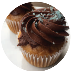
VEGAN VANILLA W/ CHOCOLATE FROSTING