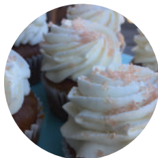
VEGAN VANILLA W/ VANILLA FROSTING