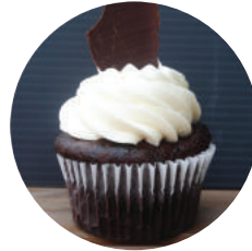
CHOCOLATE W/ VANILLA BUTTERCREAM