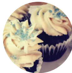
VEGAN CHOCOLATE W/ VANILLA FROSTING