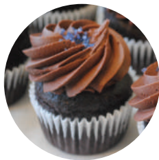
VEGAN CHOCOLATE W/ CHOCOLATE FROSTING