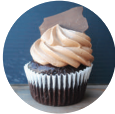
CHOCOLATE W/ CHOCOLATE BUTTERCREAM