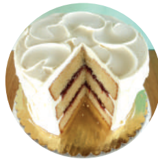
CLASSIC VANILLA CAKE