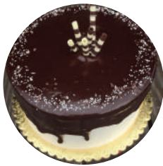
BLACK & WHITE CAKE