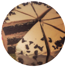
CLASSIC CHOCOLATE CAKE