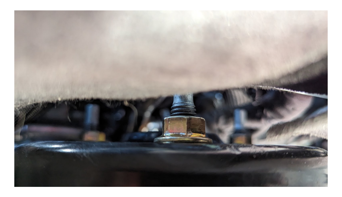
17) Reassemble suspension and repeat on other side