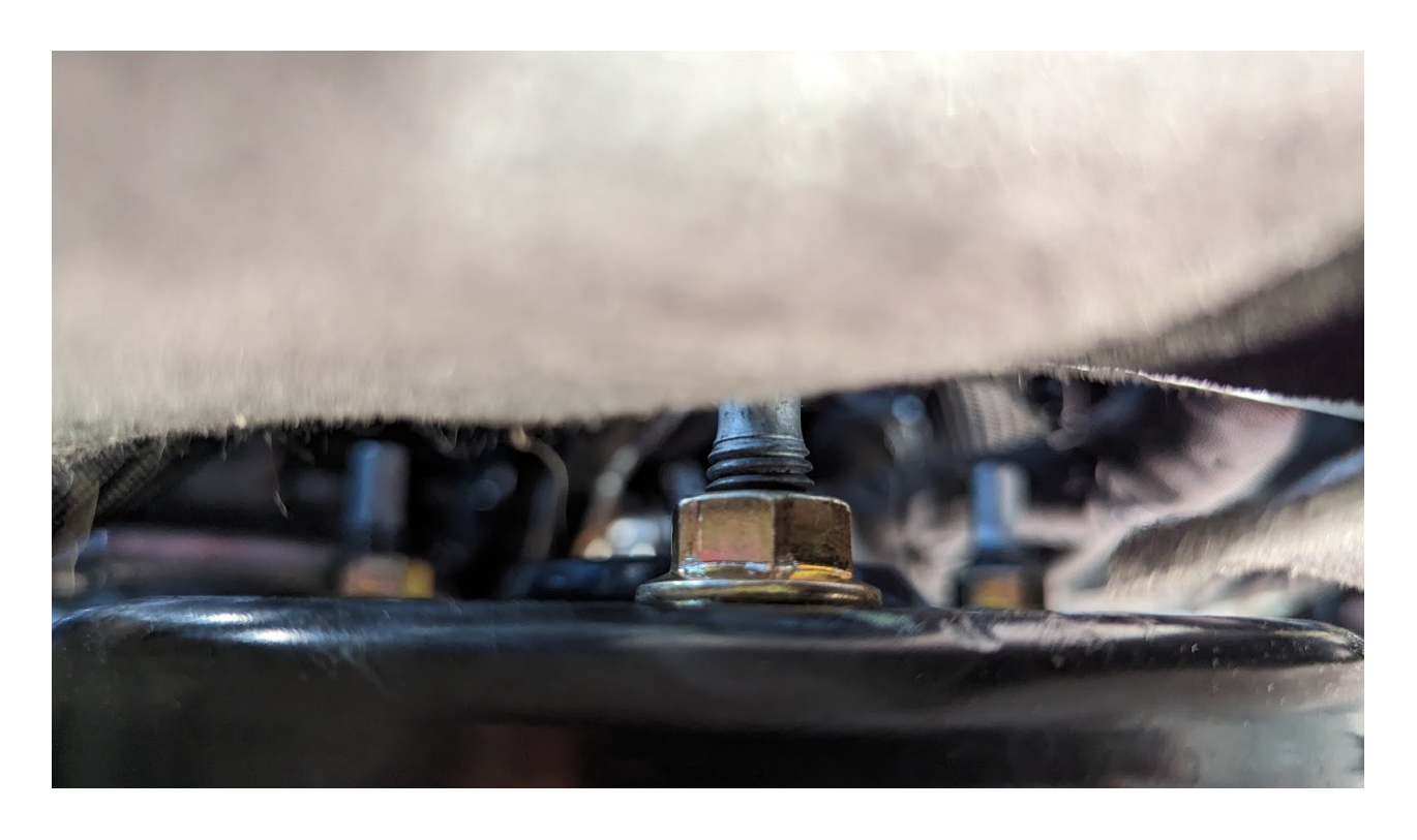
14) Reassemble suspension and repeat on both sides