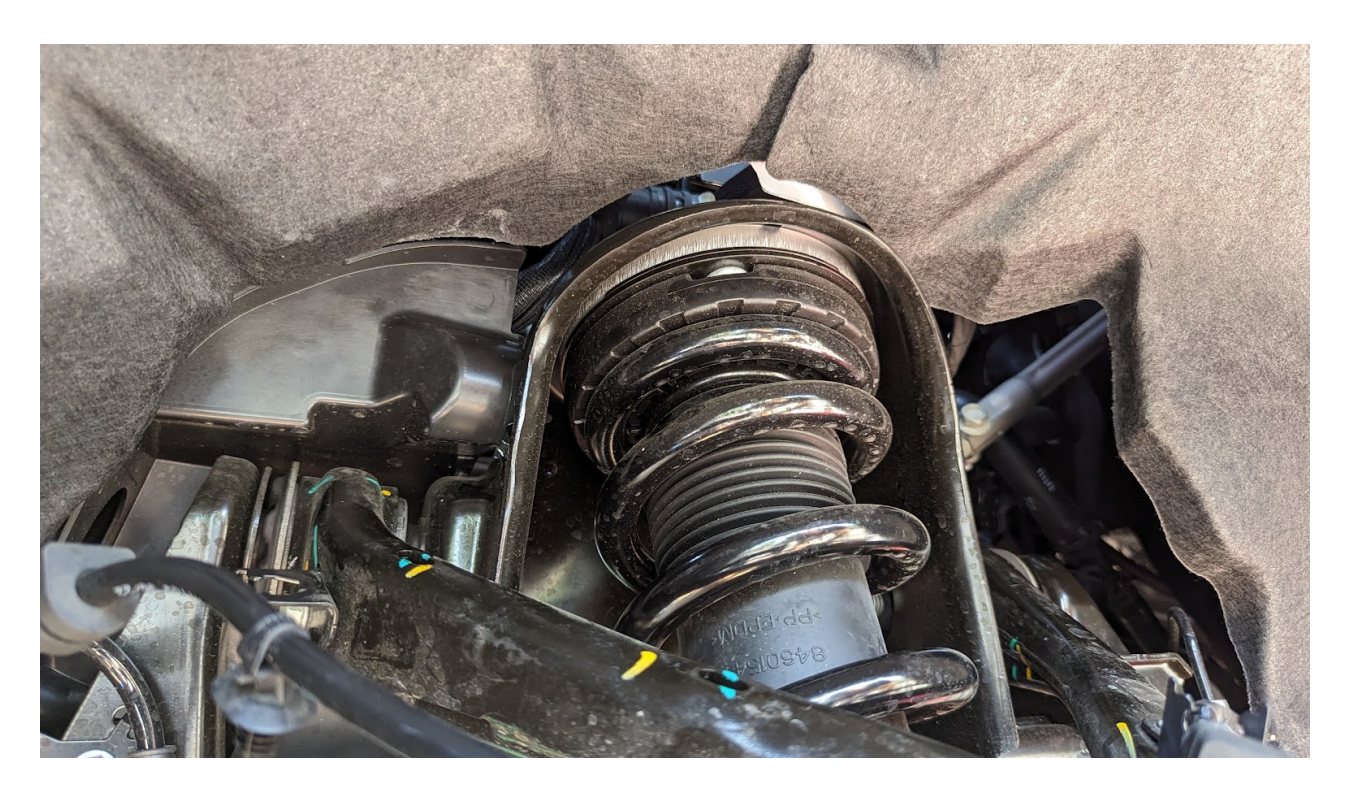
13)Install the provided hardware using 15mm ratcheting wrench