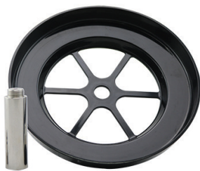
RHBRM Blender Rinsing Kit