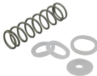
RHSPVSK-01 Spinjet Valve Gasket Kit