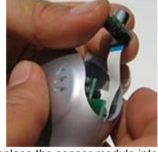
Replace the sensor module into its original position.