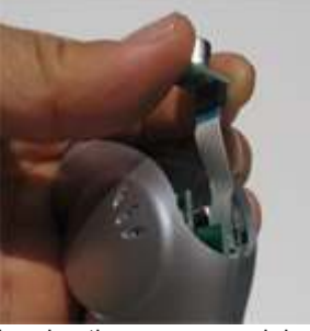
Carefully raise the sensor module from the body. Do NOT detach the cable from the body.