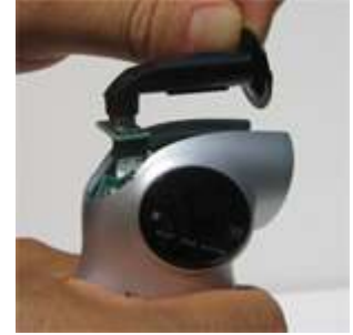
Lift the breath tube to access the sensor module.