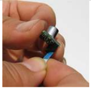
Insert the cable into the new sensor. Make sure the blue strip is toward the sensor, as shown.