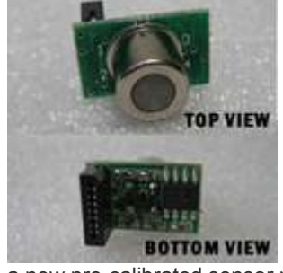
Prepare a new pre-calibrated sensor module.