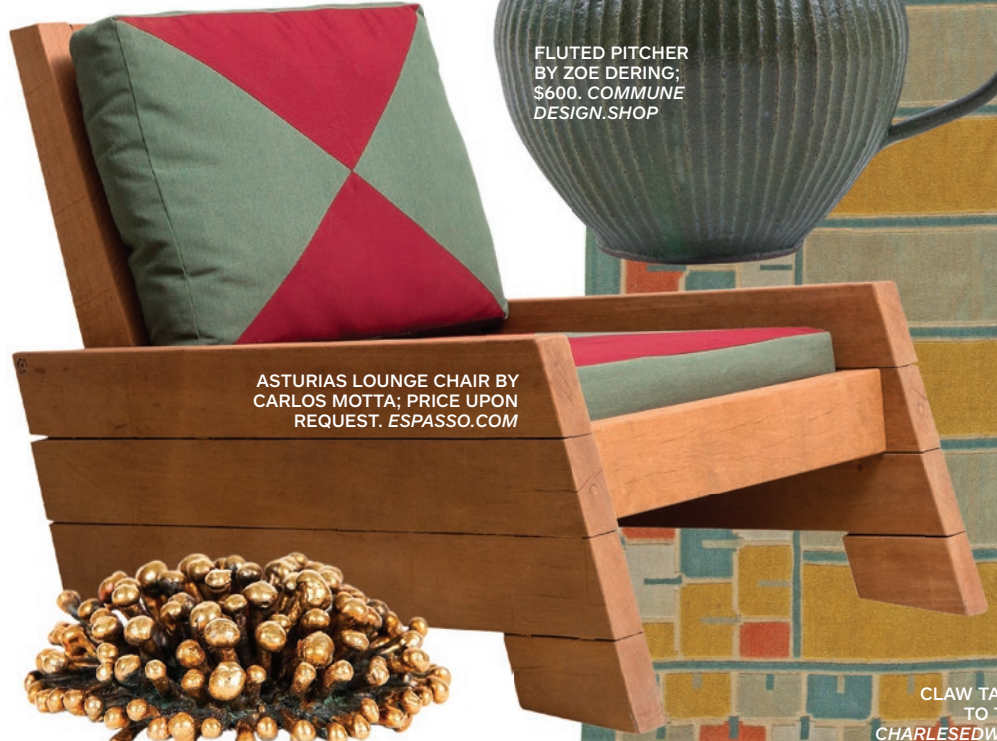
ASTURIAS LOUNGE CHAIR BY CARLOS MOTTA; PRICE UPON REQUEST. ESPASSO.COM