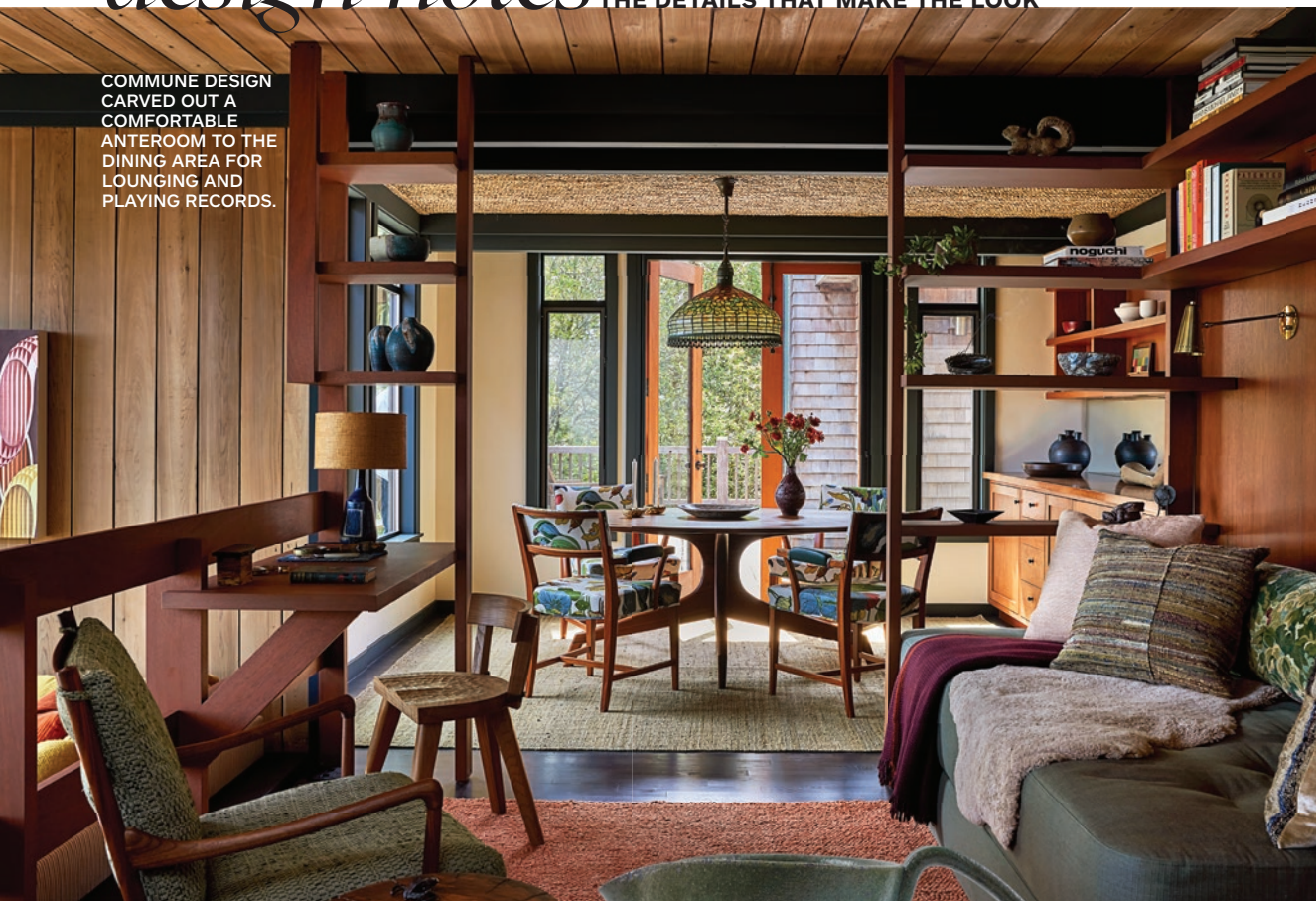
COMMUNE DESIGN CARVED OUT A COMFORTABLE ANTEROOM TO THE DINING AREA FOR LOUNGING AND PLAYING RECORDS.