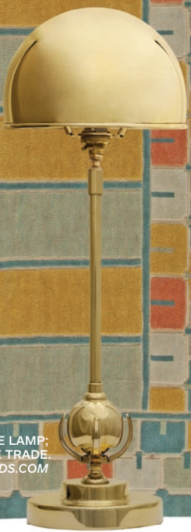
CLAW TABLE LAMP; TO THE TRADE. CHARLESEDWARDS.COM

“Scandinavian summerhouses were a big influence.”