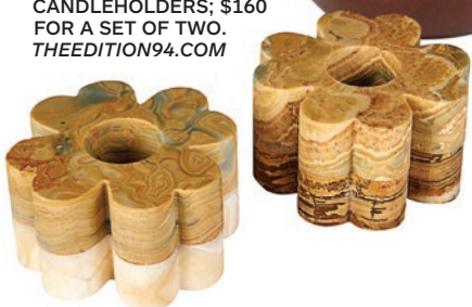
BRANIK ONYX GLACIALE CLOVER CANDLEHOLDERS; $160 FOR A SET OF TWO. THEEDITION94.COM