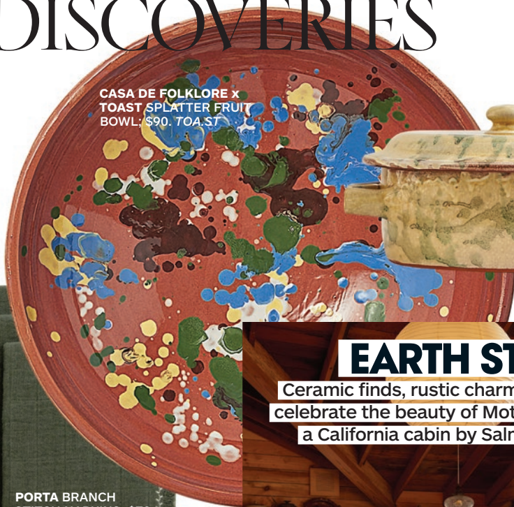
CASA DE FOLKLORE x TOAST SPLATTER FRUIT BOWL; $90. TOAST