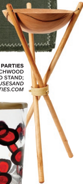
HOUSES & PARTIES BEECHWOOD SALAD STAND; $198. HOUSESAND PARTIES.COM