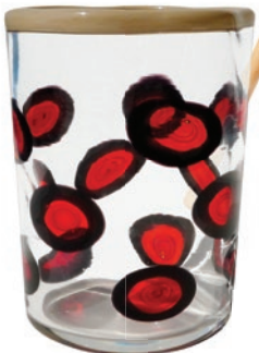
EL MONO HOME SPECKLE GLASS; $120. ELMONO HOME.COM