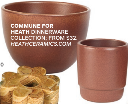
COMMUNE FOR HEATH DINNERWARE COLLECTION; FROM $32. HEATHCERAMICS.COM