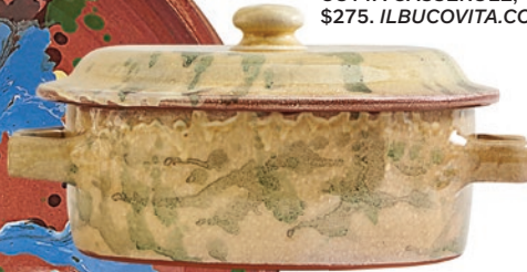
IL BUCO VITA BELLOCCHI TERRA- COTTA CASSEROLE; $275. ILBUCOVITA.COM