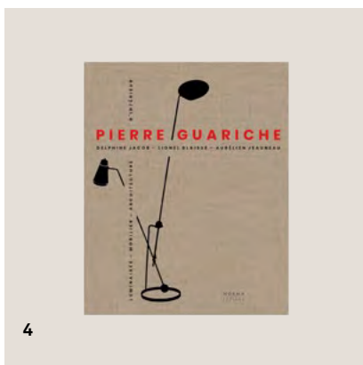
1 | “Zanshiori” cushion made from vintage Japanese textiles, created by Commune design, $600, communedesign.com — 2 | Sculptural pitcher vase, slab built with a polychrome glaze, France circa 1960, unique, 850 €, galerie Stimmung.com — 3 | “Knitting Lounge Chair”, sheepskin, by Ib Kofod-Larsen (1951), reissued by Menu, 3,595 €, menuspace.com — 4 | A first Pierre Guariche monograph written by Lionel Blaisse, Delphine Jacob and Aurélien Jeauneau, 352 pages, approx. 500 illustrations, Éditions Norma, 65 €, editions-norma.com 5 | “Stone” candlestick in recycled aluminium or brass, Ferm Living, from 15 €, fermliving.com and set of 2 green marbled candles, Ferm Living, 9 €, en.smallable.com