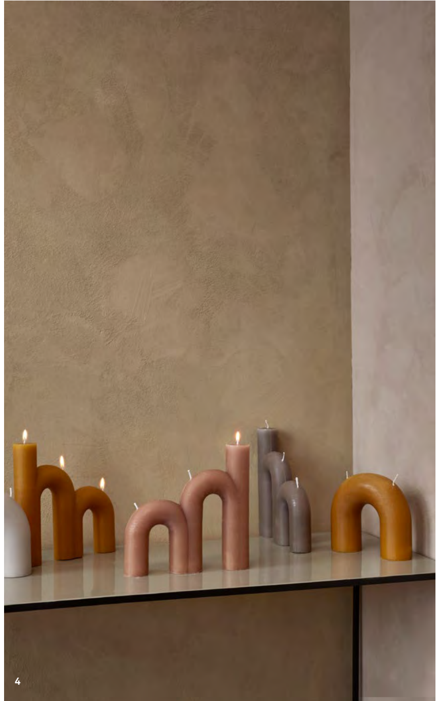
1 | Ronan Bouroullec Poster in Orange, by Ronan Bouroullec for The Wrong Shop , 59 €, available exclusively from The Conran Shop, conranshop.co.uk — 2 | Small ceramic vase created by Logan Wannamaker, $1,050, communedesign.com — 3 | Gold plated brass hoops with hammered plate engraved with the Patou logo, created by Patou, 290 €, patou.com — 4 | “Bend” curving candles, Broste Copenhagen, 32 € each from thecoolrepublic.com