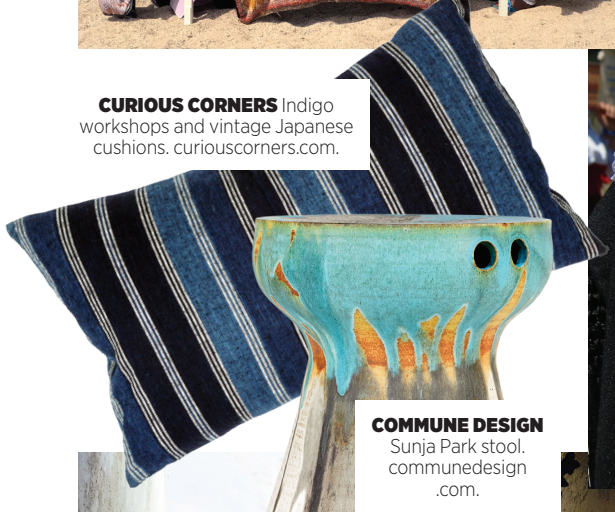
COMMUNE DESIGN Sunja Park stool. communedesign.com.