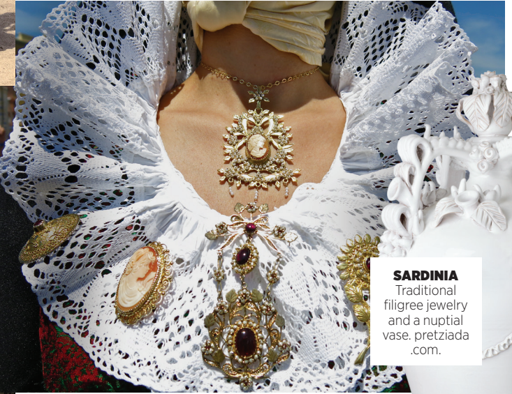
SARDINIA Traditional filigree jewelry and a nuptial vase.