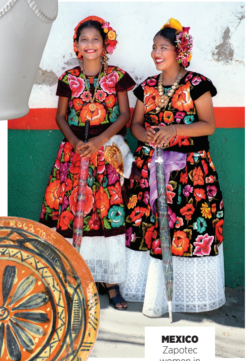
MEXICO Zapotec women in festive dress