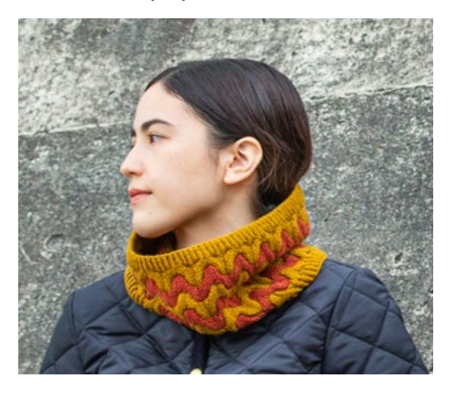
\bigvee \bigcirc || \bigcirc by Ayako Kataoka

Finished measurements: Height: 7½ (8)"/ 19 (20) cm Circumference: 21½ (24)"/ 55 (61) cm