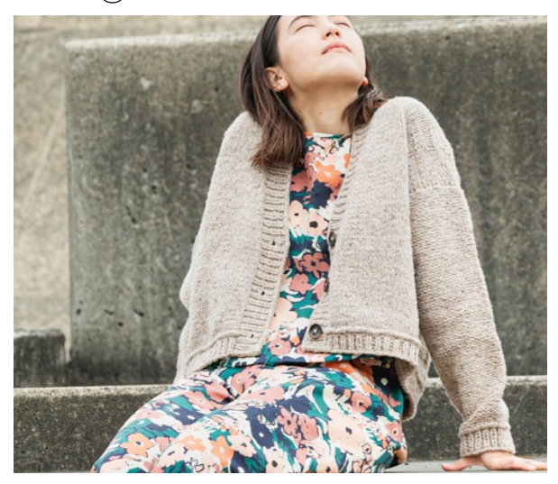
Ziegel by Fiona Alice

Finished chest measurement: 38 (42, 46, 50, 54, 58) (62, 66, 70, 74, 78¼)" 96.5 (107, 117, 127, 137.5, 147.5) (157.5, 168, 178, 188, 199) cm