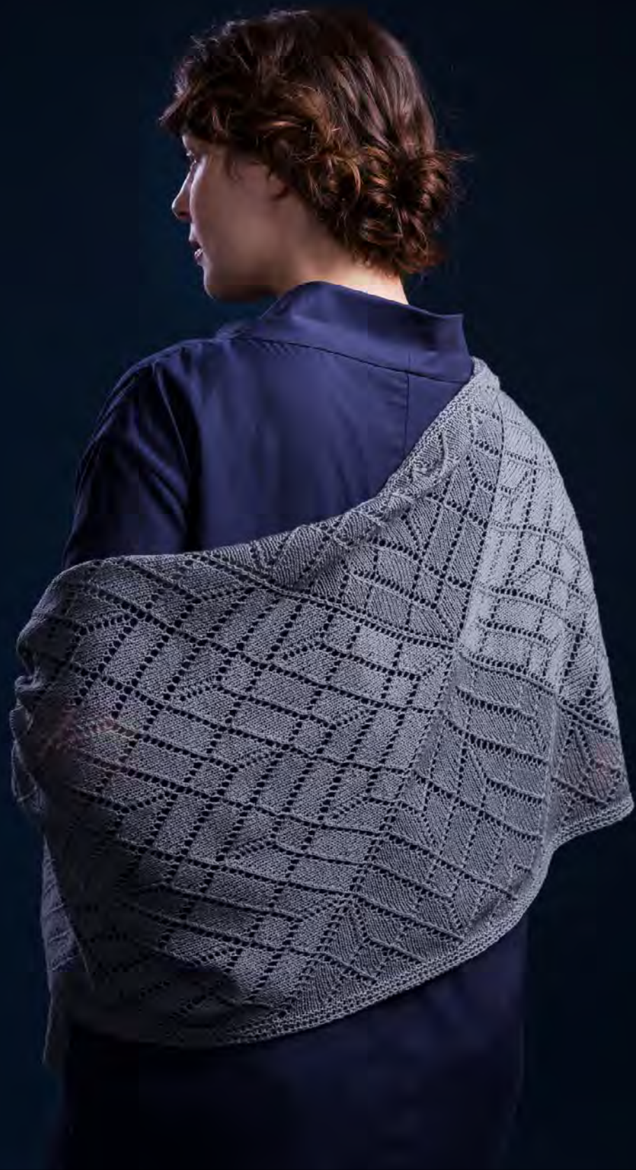
Leadlight Vale, 3 skeins Shop Pattern >