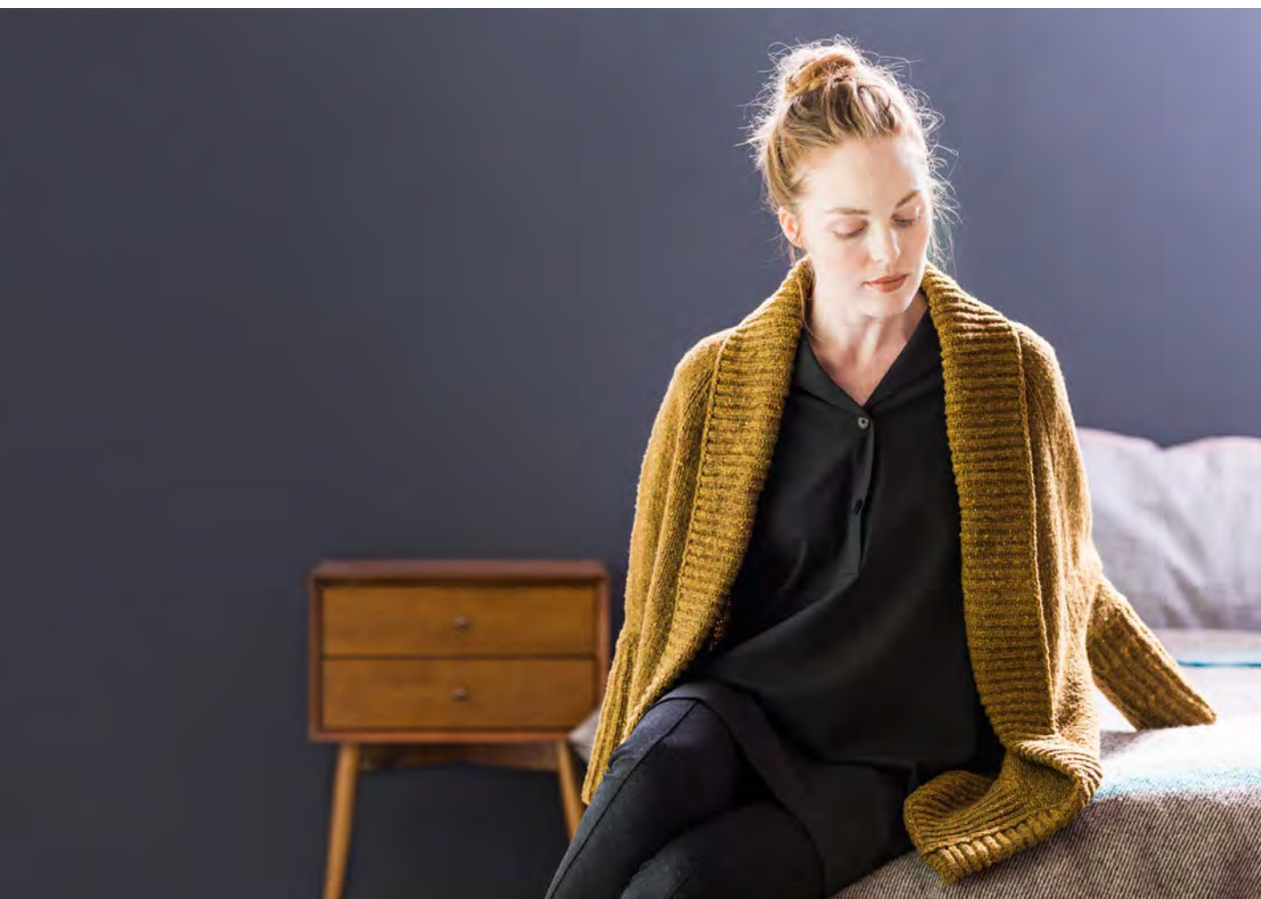
RONAN Shelter , 12–17 skeins Shop Pattern >