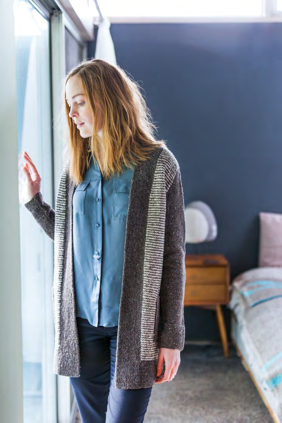
RIVET Shelter , 12–19 skeins Shop Pattern >