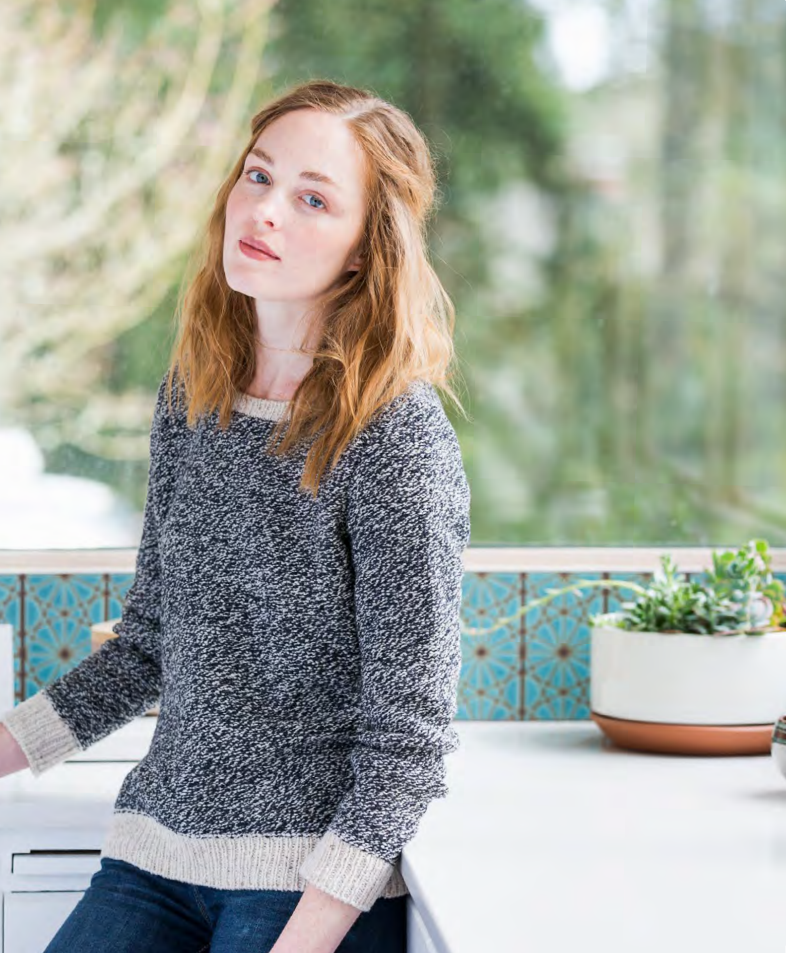
MOSSBANK Shelter , 8–13 skeins Shop Pattern >