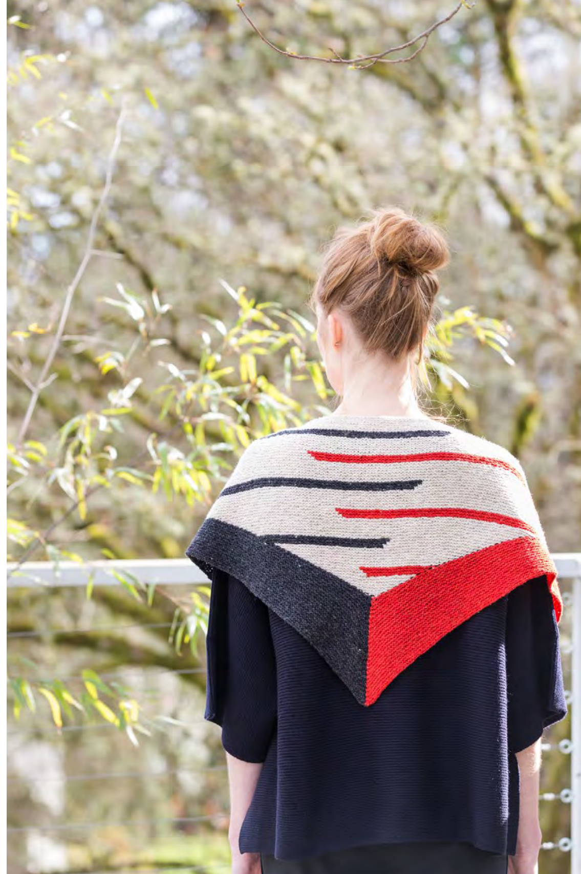
LEVEL Loft, 4–5 skeins Shop Pattern >