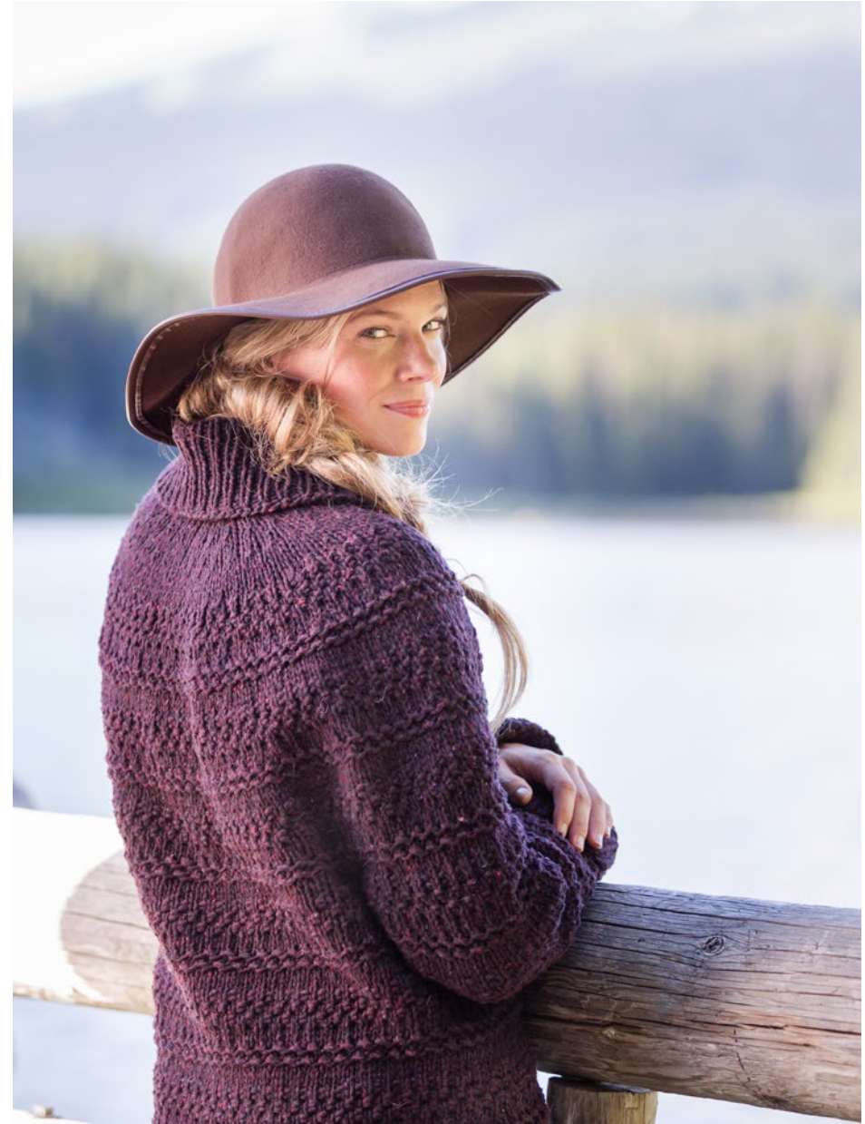
BANNOCK Cardigan Coat