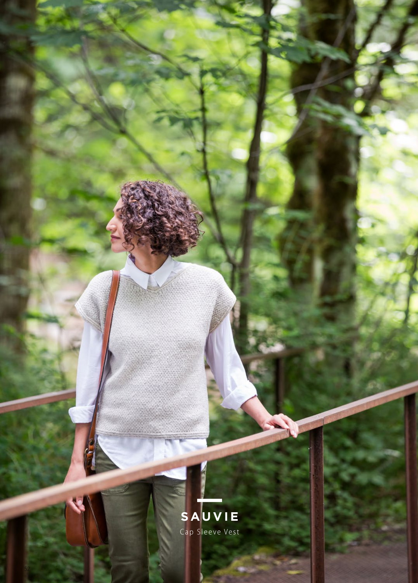
SAUVIE Cap Sleeve Vest