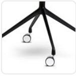
4 Way Swivel Base - Fixed Height