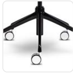
5 Way Swivel Base - Adjustable Height