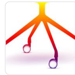
Other Powdercoat Colour (special order)