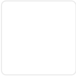
Diecast Aluminium Legs - Polished