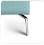
Diecast Aluminium Legs - Polished