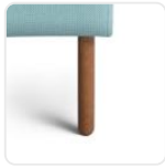
Timber Legs - Oak Stain - 450mm Seat Height