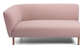
Ola Modular - Right side arm 2 seater