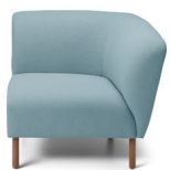
Ola Modular - Left side arm 1 seater