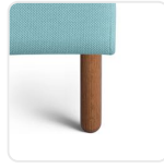
Timber Legs - Oak Stain