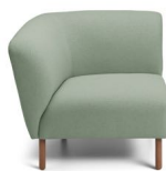
Ola Modular - Right side arm 1 seater