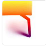
Diecast Aluminium Legs - Other Powdercoat Colour (special order)