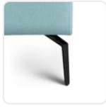
Diecast Aluminium Legs - Black Powdercoat