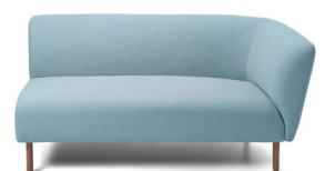
Ola Modular - Left side arm 2 seater