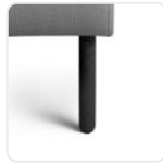
Timber Legs - Black Stain - 450mm Seat Height