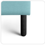
Timber Legs - Black Stain