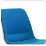
Duo Upholstery Detail