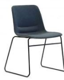
Nu Soul Sled Upholstered