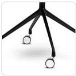
4 Way Base - Fixed Height