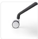
Chrome Castors / Black Tyre