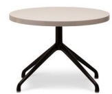
Nu Soul Coffee Table