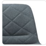
Comfort Diamond Quilted Upholstery Detail