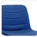
Comfort Straight Quilted Upholstery Detail