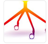
Other Powdercoat Colour (special order)