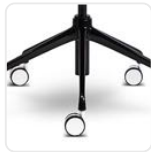
5 Way Base - Adjustable Height