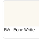
BW - Bone White