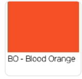
BO - Blood Orange