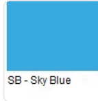
SB - Sky Blue