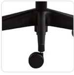
Black Nylon Base