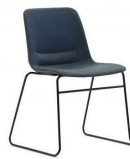
Nu Soul Sled Upholstered