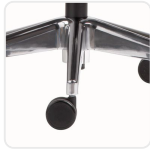
Polished Aluminium Base