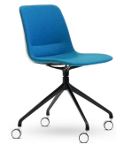
Nu Soul Swivel Upholstered