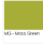
MG - Moss Green