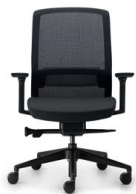
Aveya - Black