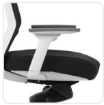
Plush Seat (Extra Foam)