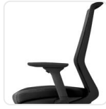
Multi Directional Adjustable Arms