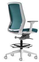
Aveya Drafting - White