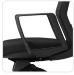
Flare Fixed Arms