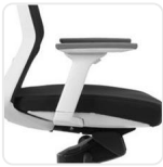
Standard Seat Foam