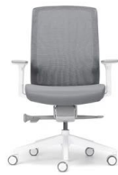
Aveya - White