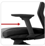
Adjustable Seat Depth